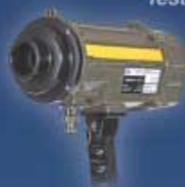
Flight Line Testers