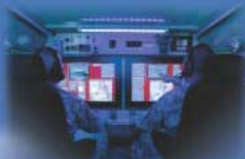
Unmanned Command and Control Technologies