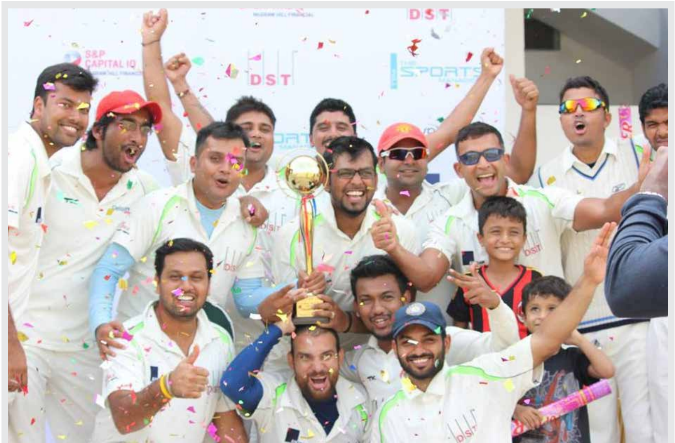
Deloitte Team – Winners of Cricket – AmCham Sports 2015