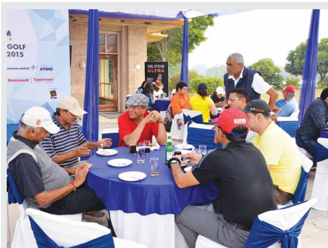
Refreshment time for the players