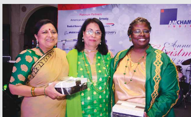
These guests received gifts for being the best dressed, according to the golden and green theme