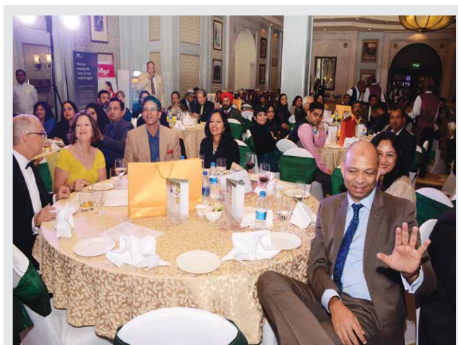
Guests at the Christmas Ball