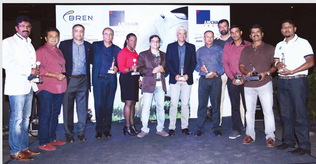
Winners of the golf tournament