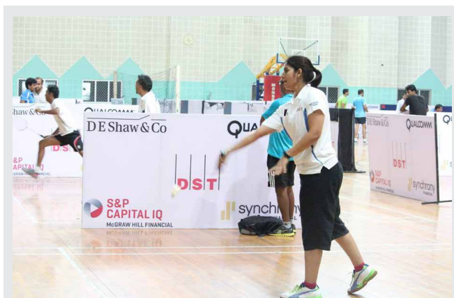
Badminton at Yousufguda Indoor Stadium

More than 1,300 people from AmCham member companies participated in AmCham Hyderabad Sports 2015.