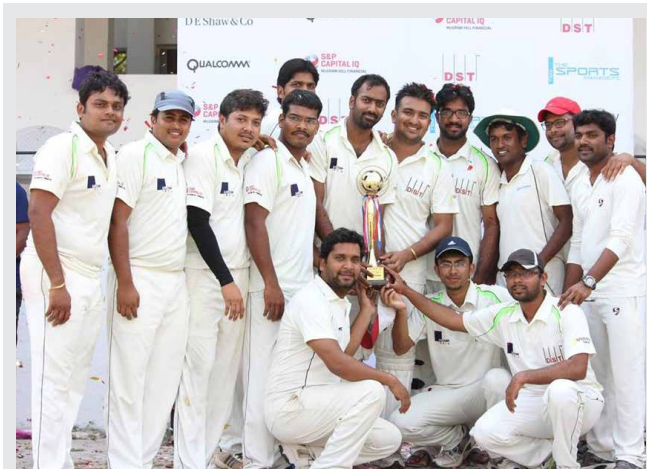
Qualcomm Team-Runner up of Cricket AmCham Sports 2015