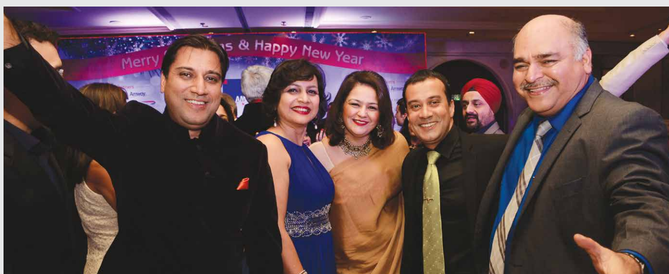
AmCham members enjoying the entertainment