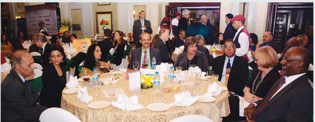
Members at the Boeing sponsored table