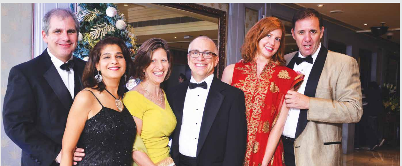
Officials from the U.S. Embassy