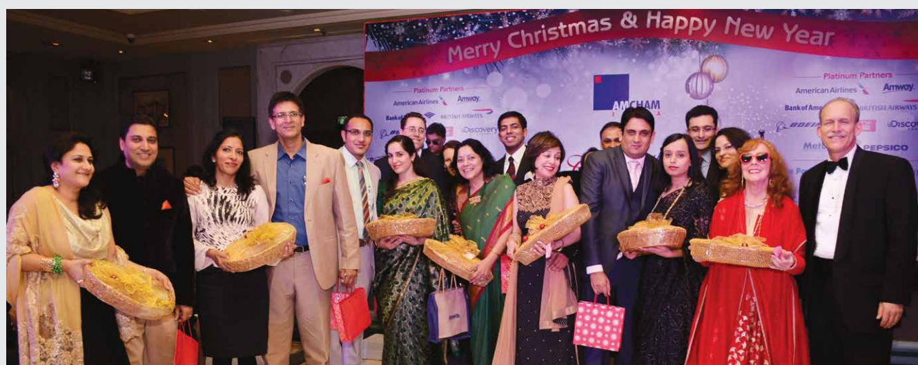
The winners of the couples game receiving their gifts