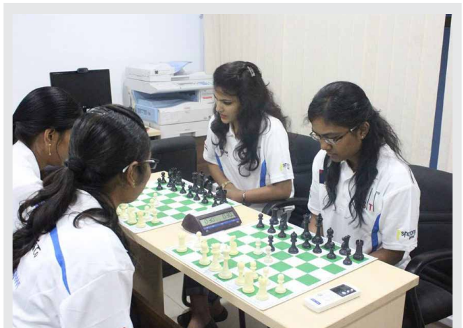
Women's chess at St. Jude Medical