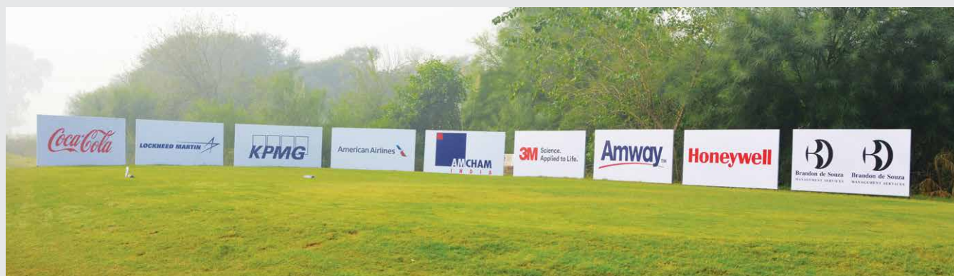
Thanks to the sponsors!