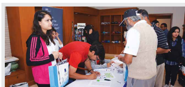
AmCham golfer at pre-function area for the registration of AmCham India Amateur Invitational Golf Tournament 2015

well. To give all golfers a fair chance of winning the prizes we played the "Single Pierio" format in two categories below 18 and 18 to 24 handicap. We look forward to a continued and active participation by members next year as well. Members will now play the 5th AmCham India Invitational Amateur Golf tournament (South) on the 5th of December in Bangalore. Golf provides an excellent networking opportunity to play and discuss business in an enjoyable environment.