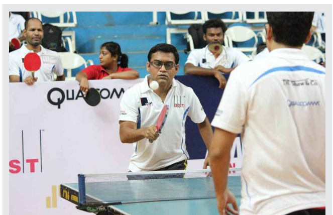
Table tennis matches at Yousufguda Indoor Stadium