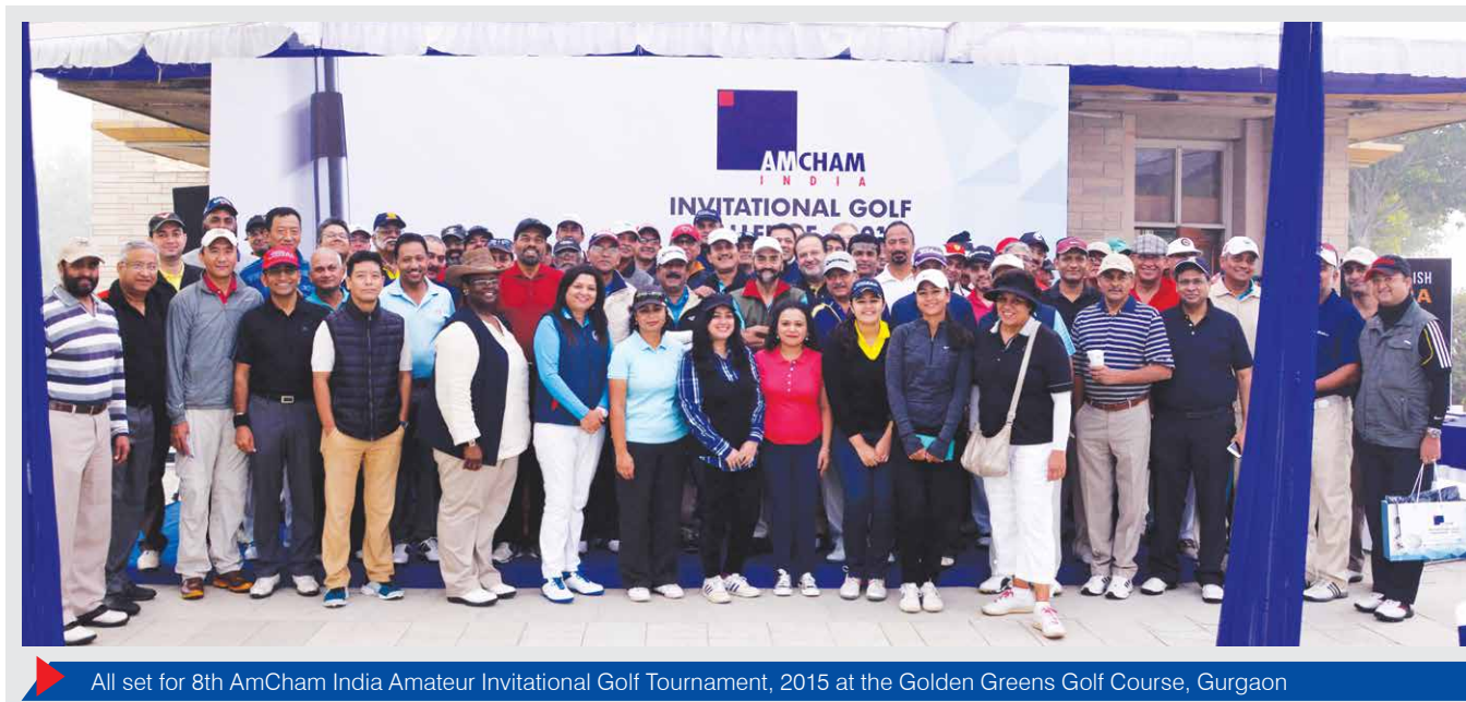
All set for 8th AmCham India Amateur Invitational Golf Tournament, 2015 at the Golden Greens Golf Course, Gurgaon