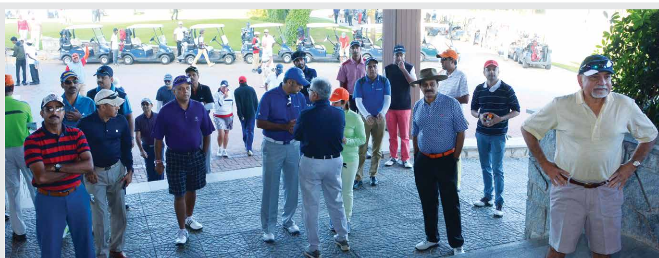
Participants anxiously waiting to tee off!