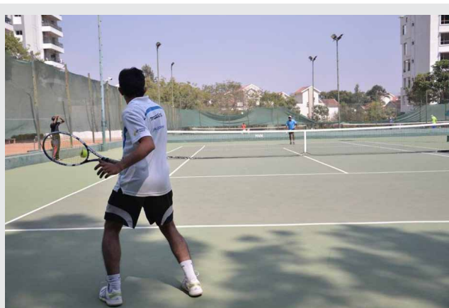
Tennis at NVK Tennis Academy Men Singles Finals – Qualcomm vs C A India