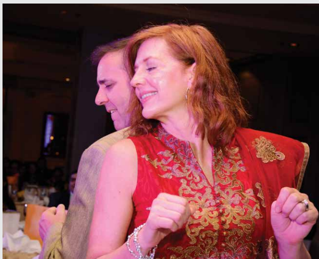
Guests enjoying the evening