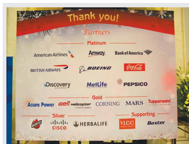
Thank you to our sponsors!