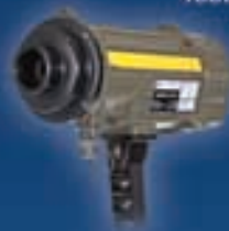
Flight Line Testers