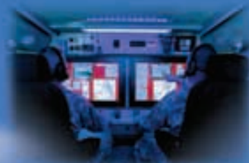
Unmanned Command and Control Technologies