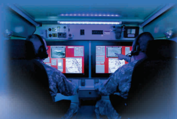
Unmanned Command and Control Technologies