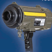
Flight Line Testers