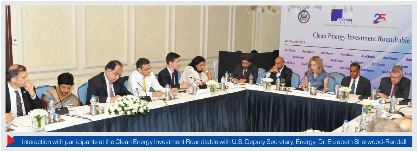
Interaction with participants at the Clean Energy Investment Roundtable with U.S. Deputy Secretary, Energy, Dr. Elizabeth Sherwood-Randall