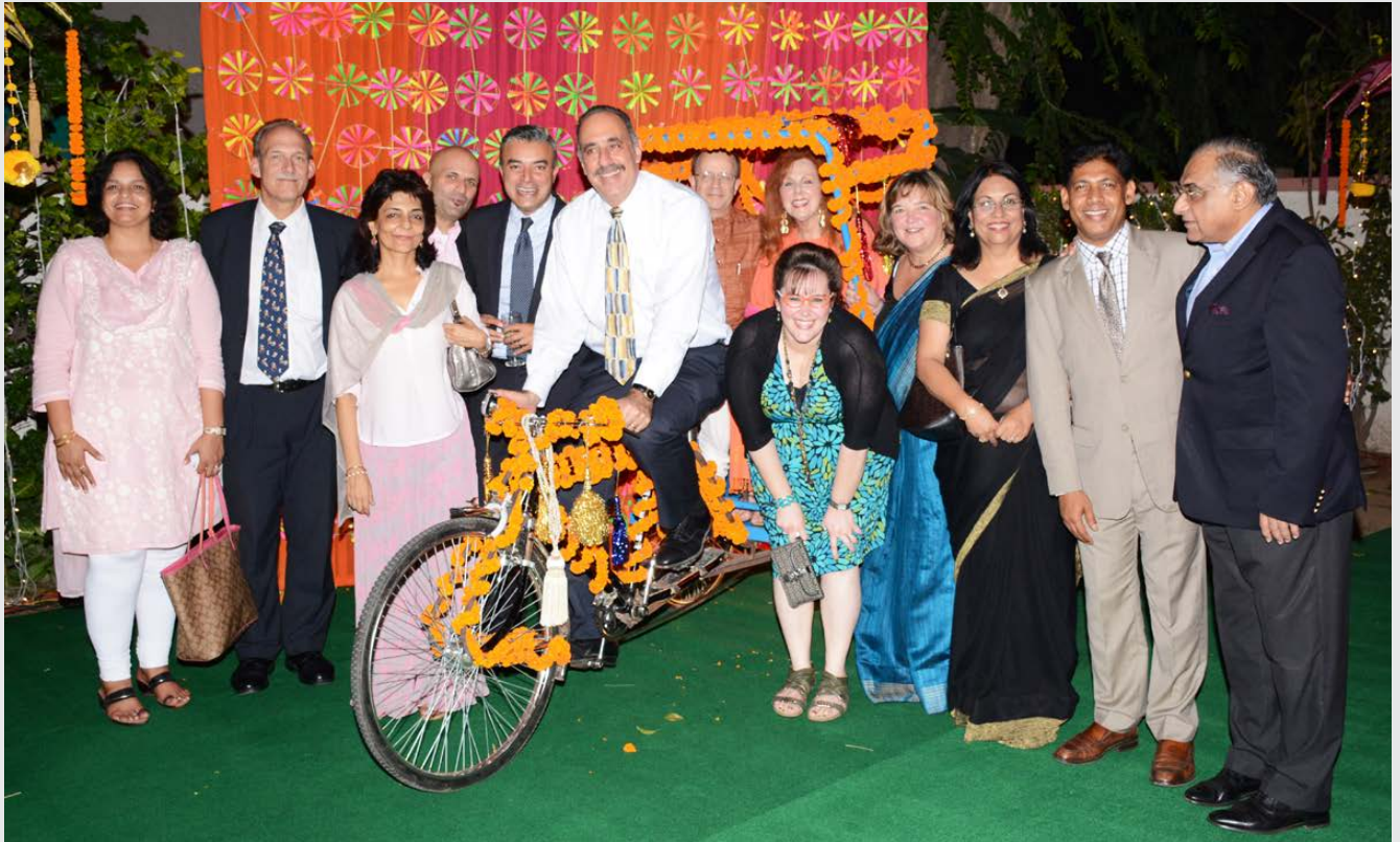
Members and U.S. Embassy officials at the AmCham farewell and welcome reception for the Minister Counselor for Commercial Affairs