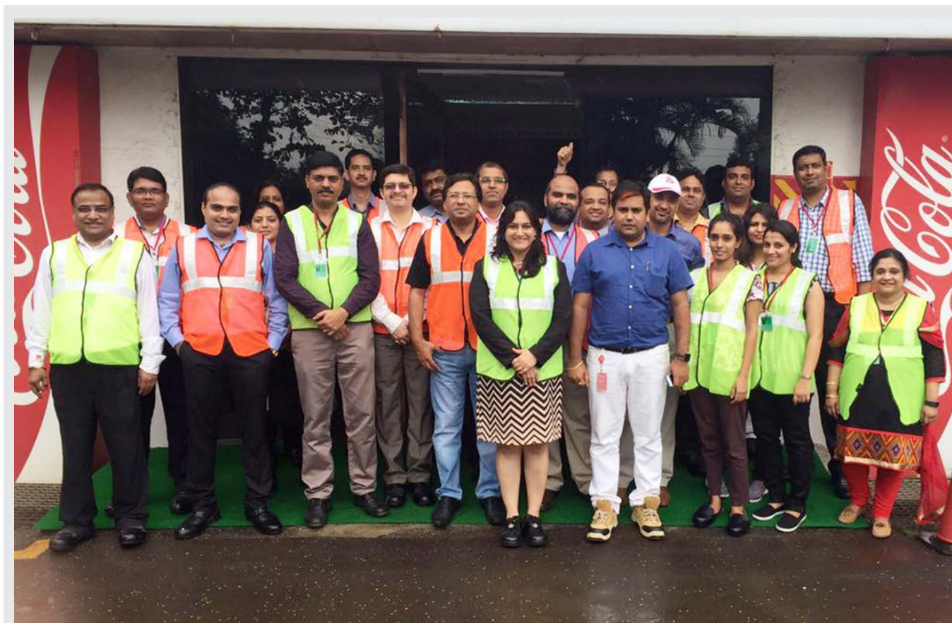
AmCham's Supply Chain and Logistics Committee Plant Visit to the Hindustan Coca Cola Beverages in Wada, Maharashtra