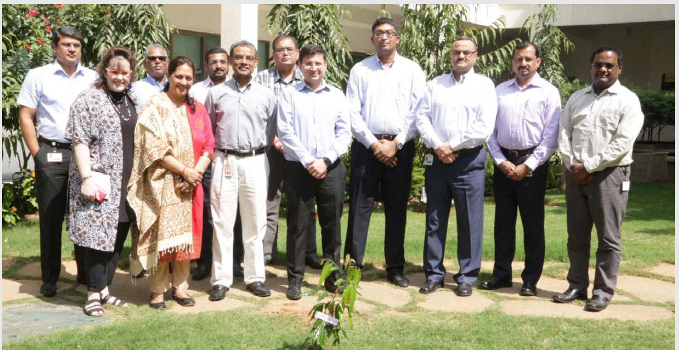
AmCham's Manufacturing Committee members with Timken colleagues