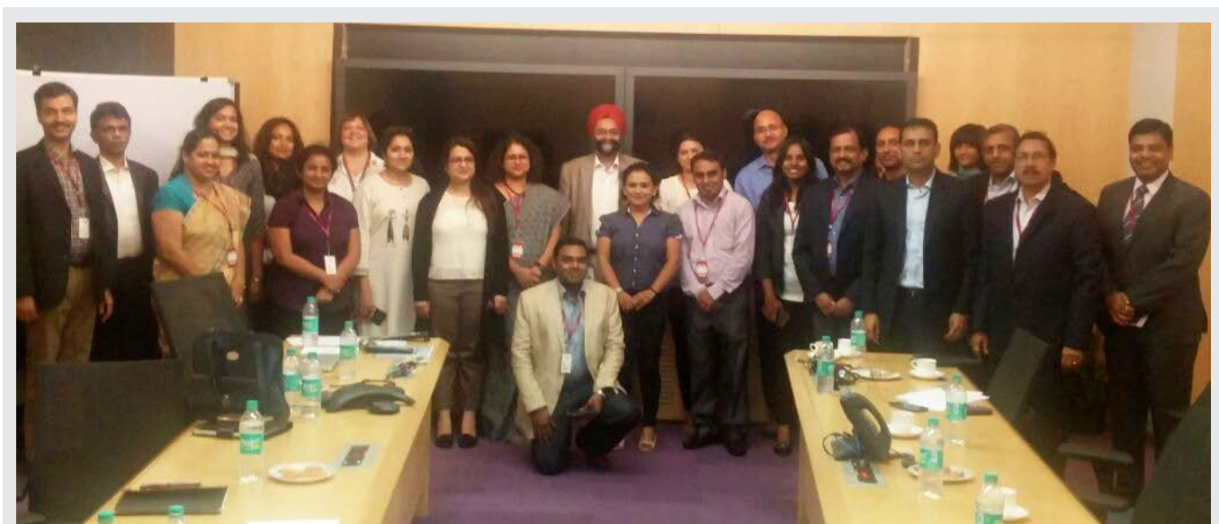
Members of AmCham's HR Committee at the committee meeting at the IBM office in Bangalore