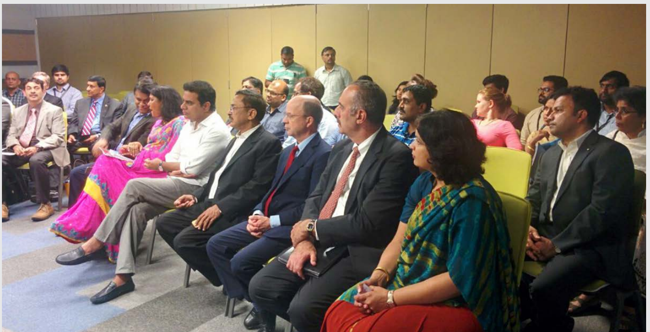
National Executive Board members with Minister K.T. Rama Rao at the T-Hub in Hyderabad