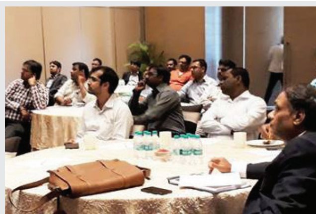
Participants at the session on Transfer Pricing and GST