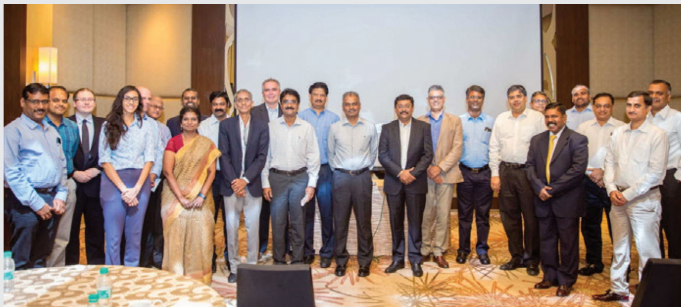
Participants in the breakfast meeting on 'Protection of Life and Property in Chennai'