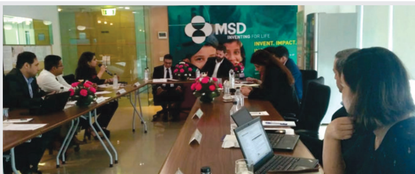
A meeting of AMCHAM's Pharmaceuticals Committee in progress at the office of MSD in Gurugram