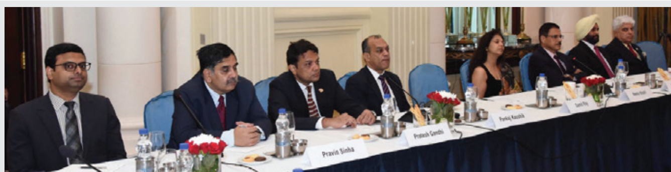
AMCHAM members during the interaction