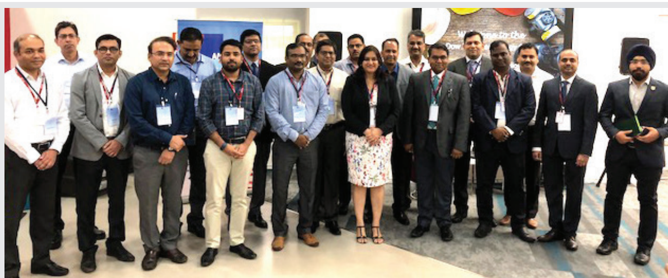
AMCHAM's Supply Chain & Logistics Committee members at Dow India Technology Centre in Navi Mumbai as part of it's Sharing and Learning Initiative

With protective gear on, the participants were then ushered on a visit to the various laboratories within the facility. With highly skilled R&D professionals at the centre, the Dow India Technology Centre was indeed a world class facility providing cross industry solutions and offers. The event was well attended.