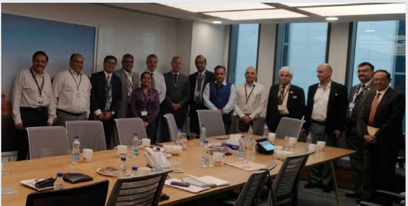
Defense Committee Members

of India meetings. There was a brief discussion on the recent Ministry of Defence issued guidelines. Members were also updated about the key upcoming AMCHAM events.