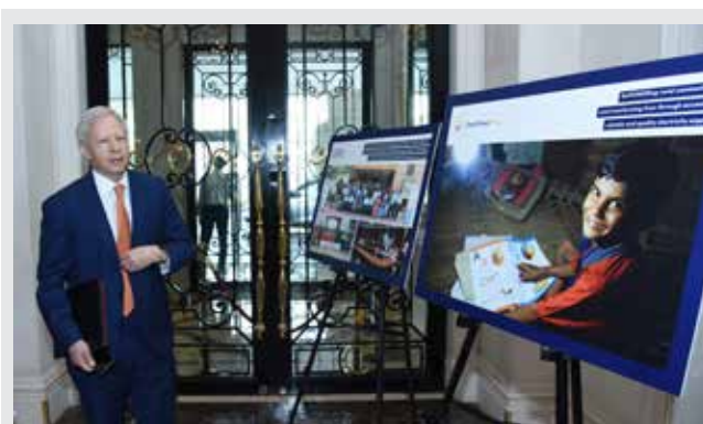
Ambassador Kenneth I. Juster looking at the photo exhibition of AMCHAM's coffee table book 'Investing in People - Changing Lives: U.S. Companies in India'

Ambassador Dr. S. Jaishankar, former Foreign Secretary, GOI, in his address, explained the transformation of Indo American relations over the last twenty years and emphasized the change in mindset was visible on the economic side. In reflecting on the causes of the transformation of the relationship he outlined the end of the Cold War which expanded political and security partnerships. He also touched upon the removal of geo political differences and the larger societal feelings between countries, such as the Indian diaspora in the U.S., that has resulted in increasing appreciation. Ambassador Jaishankar discussed how digitization was central to India's growth process and how a new equilibrium would emerge in different sectors.