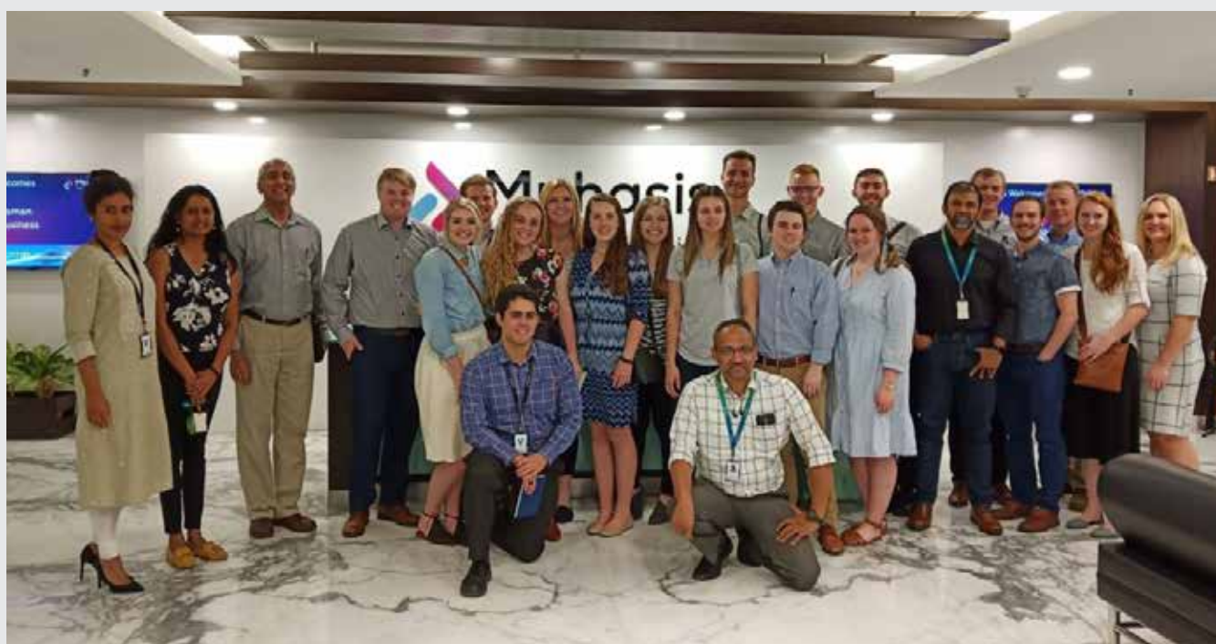
Students of Jon M. Huntsman School of Business, Utah State University at Mphasis