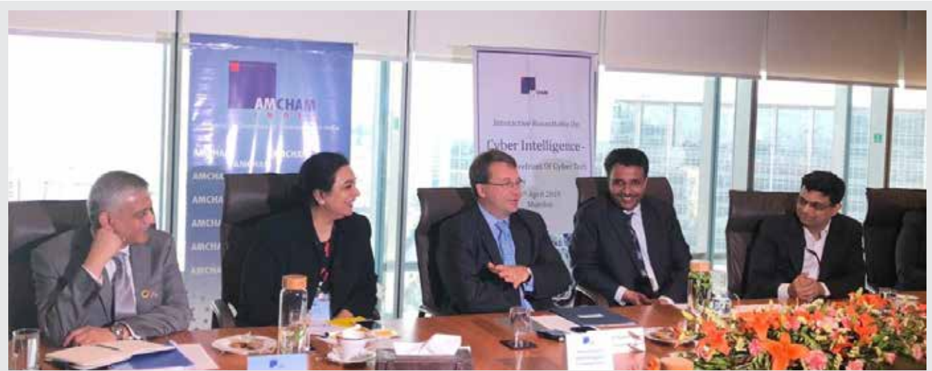
(Center) Consul General Edgard D. Kagan makes the special address at the interactive roundtable