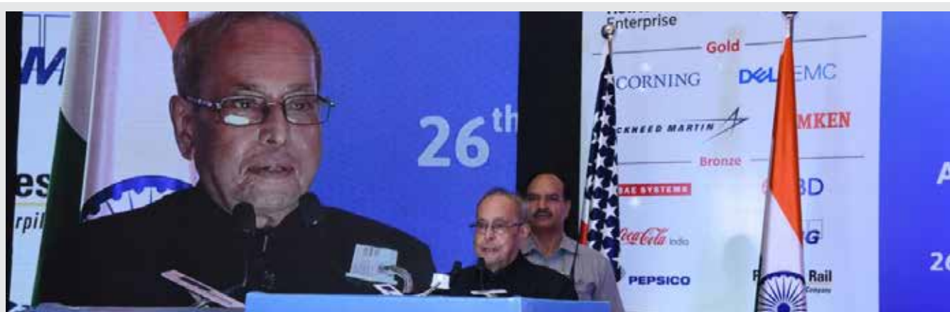
Shri Pranab Mukherjee, Hon'ble Former President of India

of the specific areas where collaborations have been significant which included healthcare, technology, smart cities, agriculture, infrastructure and energy. He expressed that sustainable growth cannot take place in silos, it should be orderly and inclusive.