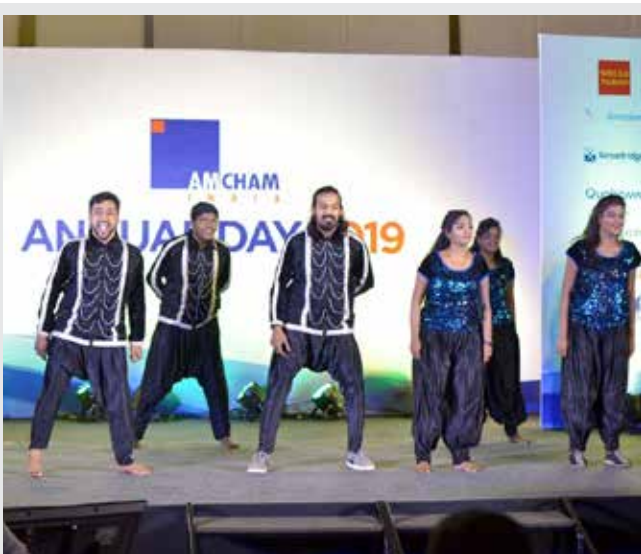
CDK Global employees perform a group dance