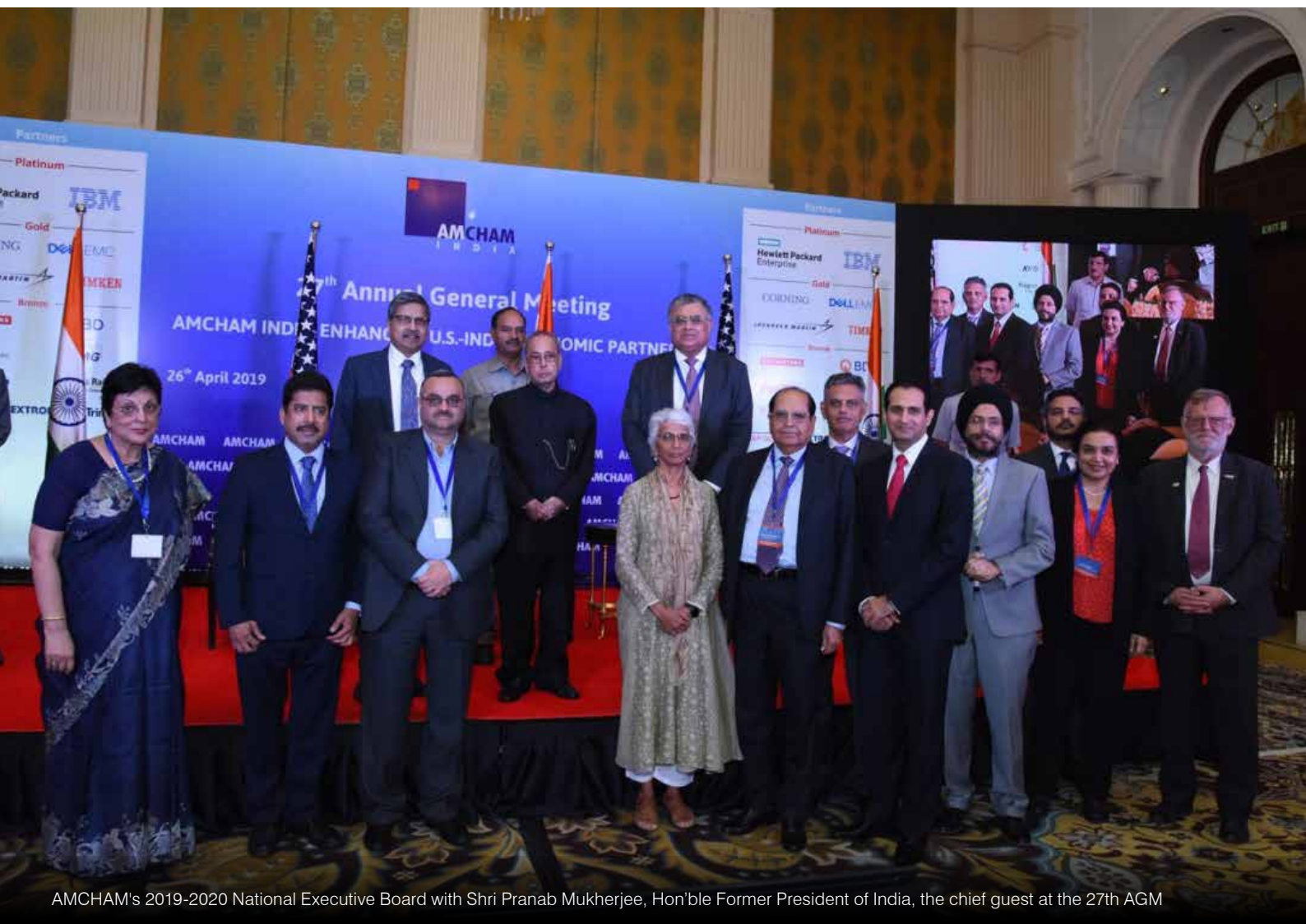
AMCHAM's 2019-2020 National Executive Board with Shri Pranab Mukherjee, Hon'ble Former President of India, the chief guest at the 27th AGM