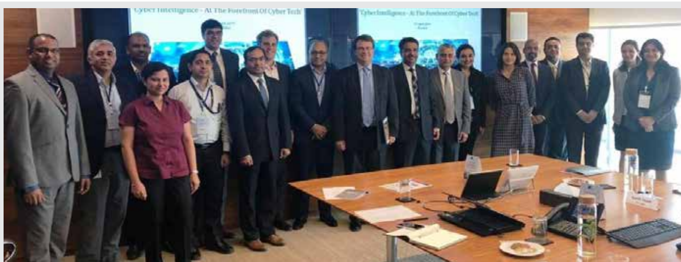
Participants at the interactive roundtable