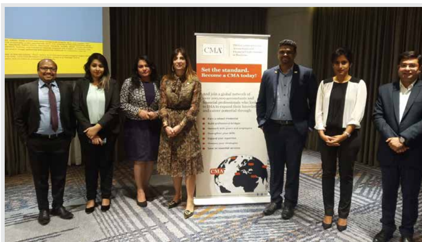
Participants at the session