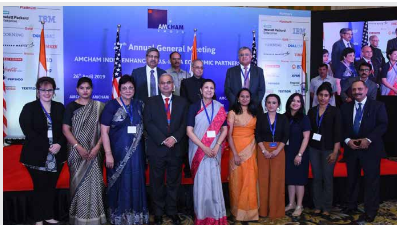
Shri Pranab Mukherjee, Hon'ble Former President of India, with AMCHAM's Secretariat