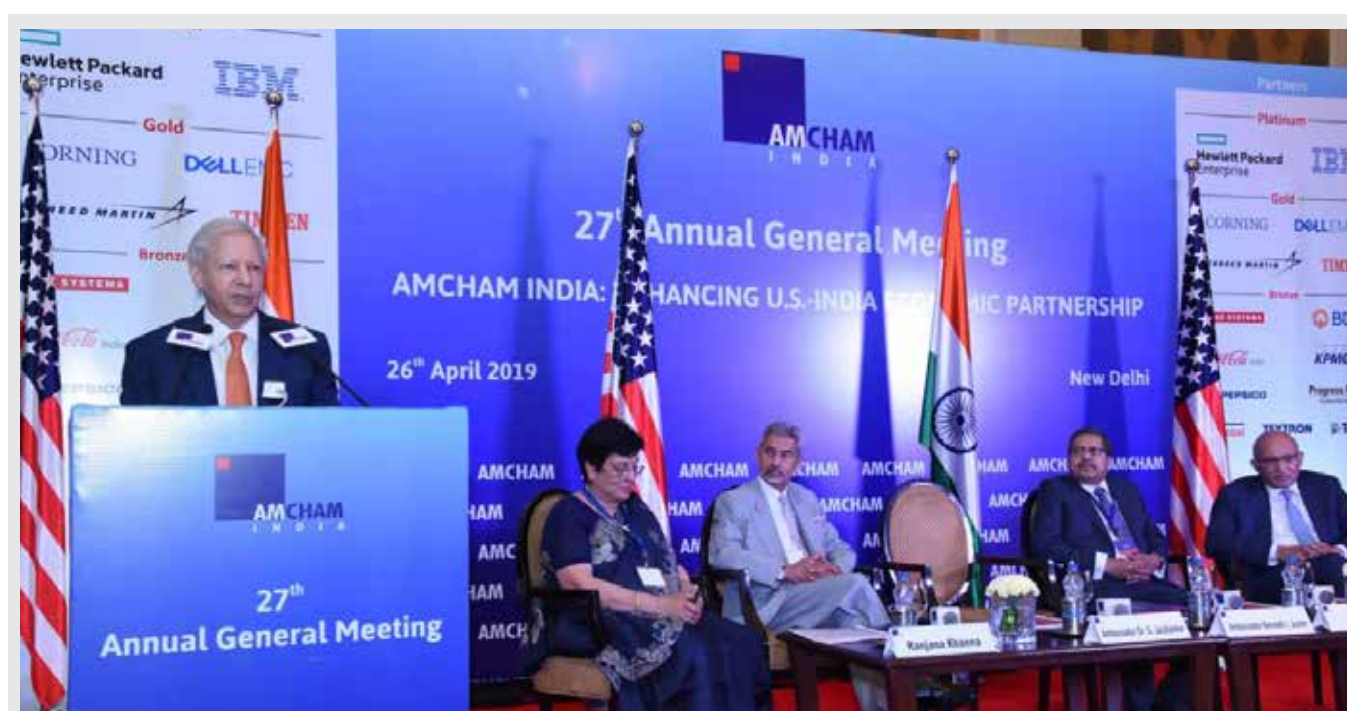
Ambassador Kenneth I. Juster delivering the keynote speech during the inaugural session

Ambassador Kenneth I. Juster, U.S. Ambassador to India delivered the keynote address, in which he recognized the hard work put in by the American business community to strengthen the U.S.-India economic partnership. He also talked about the importance for both countries to play a role in the Indo-Pacific.