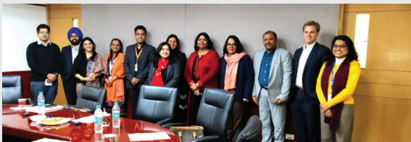
Anti-Corruption & FCPA Committee members

programs in 2019, usefulness of chat BOTs, processing payments for third parties, tracking for trainings – how is it maintained, and use of artificial intelligence by compliance teams and investigators. The meeting concluded with suggestions on topics of interest for upcoming meetings. It was decided that the next meeting would be held in March.