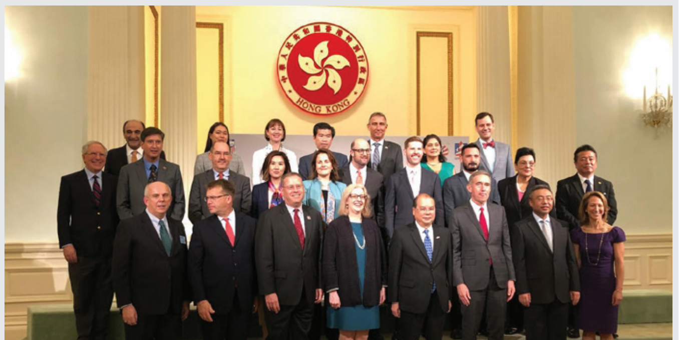
APCAC Presidents and Executive Directors at the Government House