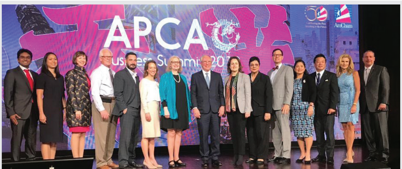
Asia Pacific Council of American Chambers of Commerce (APCAC) Executive Directors and Presidents at the APCAC Business Summit in Hong Kong

The impact of American business leadership in Asia has a proven track record of advancing innovation, sustainable growth, and social development. APCAC looks forward to the important work ahead and next year's Spring Business Summit, which will be held in Singapore in March 2020. For more information, please visit www.apcac.org .