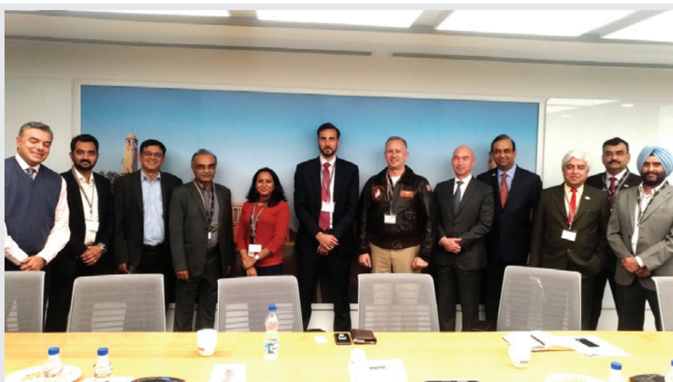
Defense Committee at the January committee meeting

agenda for the committee for the first quarter of 2019 was discussed and the recent policy issues taken up by the committee were shared with the larger team. The upcoming USG high level delegation visits and AMCHAM traction with GoI officials were deliberated upon.