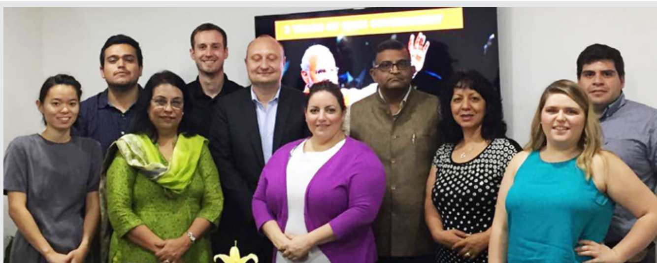
AMCHAM met with students from the University of Texas visiting India as part of their B.S. in global business