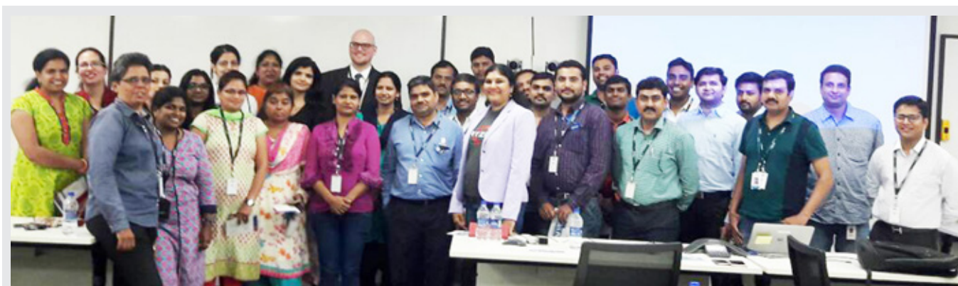
Participants at the session on U.S. visas in Hyderabad

Prevention Manager from the U.S. Consulate Hyderabad gave a presentation on U.S. visas and opened the floor for questions. Many questions were raised by various company representatives and they were answered satisfactorily.