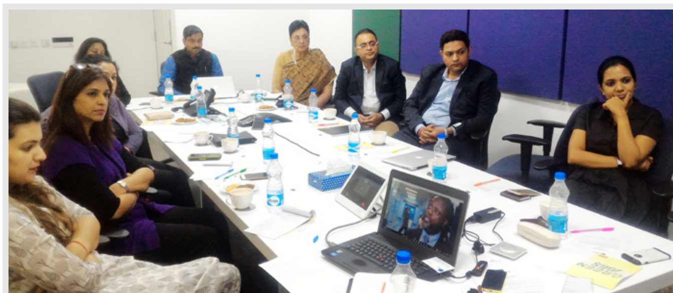
CSR Committee members watching a video presentation on IBM's P-Tech Program

It was decided the committee would have four committee meetings a year and that it would be helpful to have another session with the Indian Institute of Corporate Affairs to learn about new developments in the national volunteer guidelines and any new nuances in laws that would be applicable to CSR.