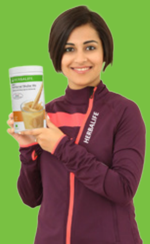
Virat Kohli Cricket, India

"I love starting my day with Herbalife's Formula 1 Nutritional Shake Mix. What you put into your body shows in you. Nutrition is really important for an active lifestyle."