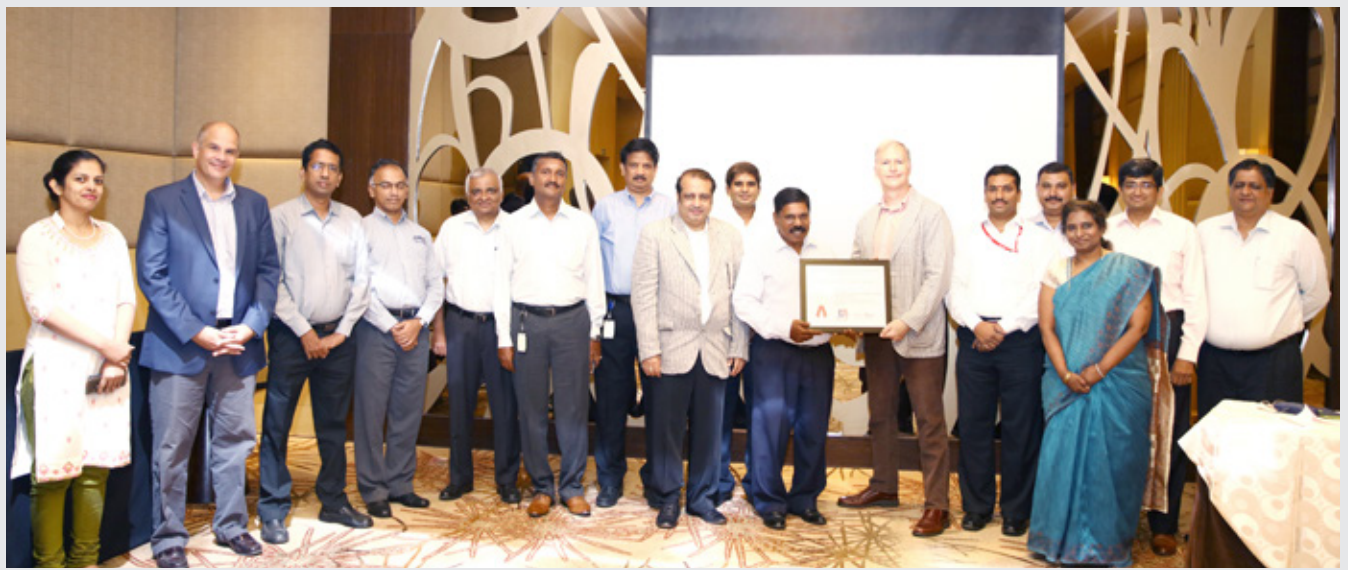
Participants at the Tamil Nadu Chapter May breakfast meeting