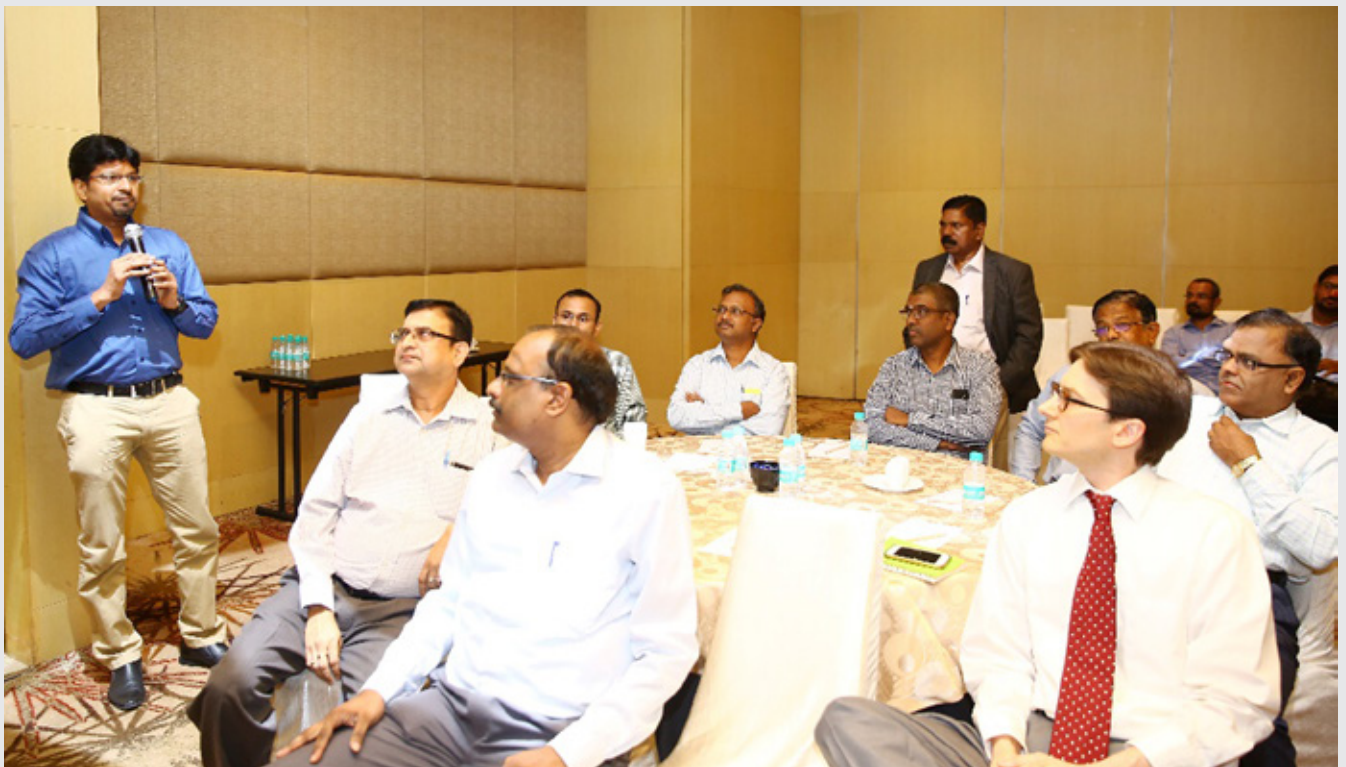
A participant posing a question to the panel