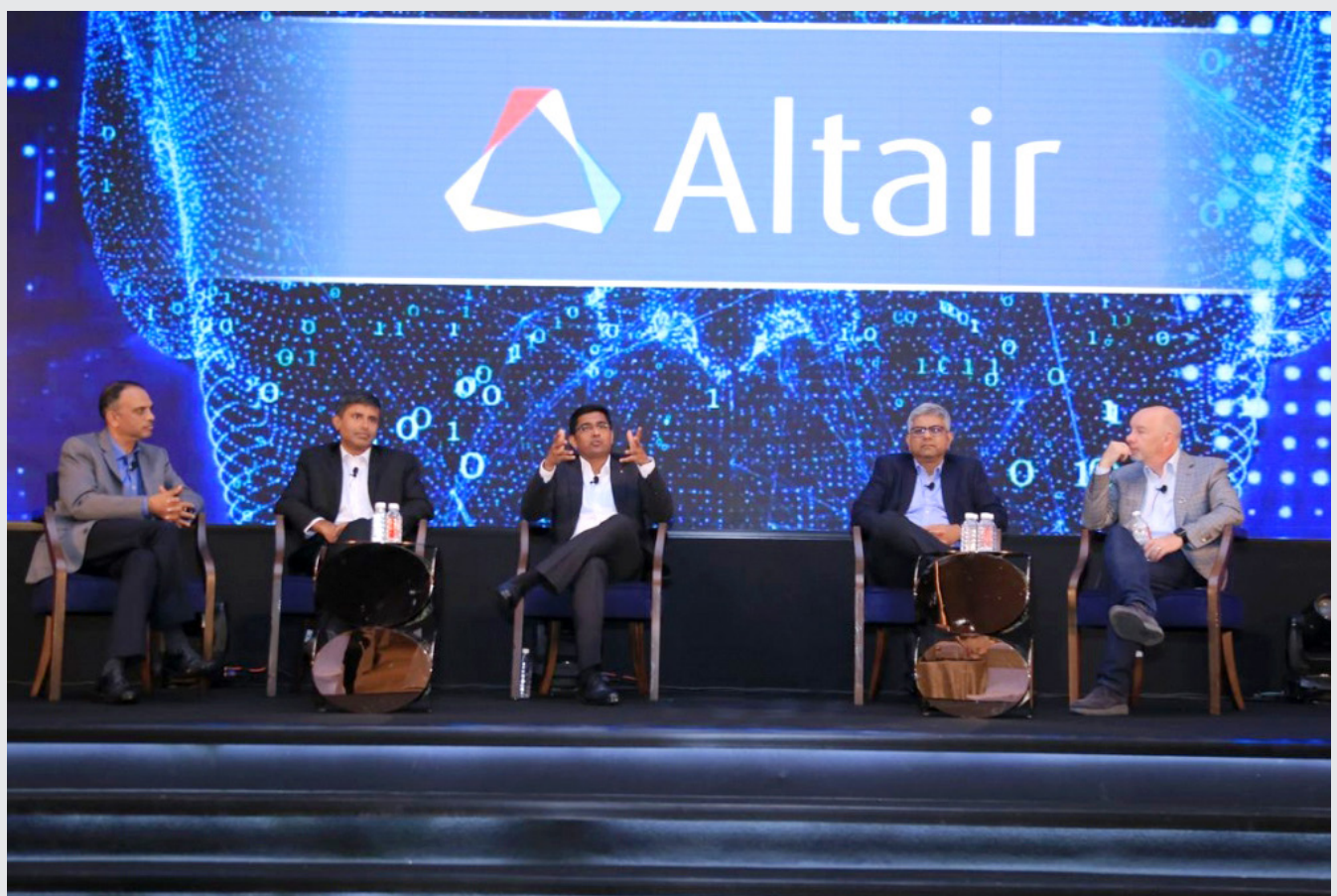
▶ Altair Leadership Conclave on 'Artificial Intelligence & the Future of Product Life Cycle'