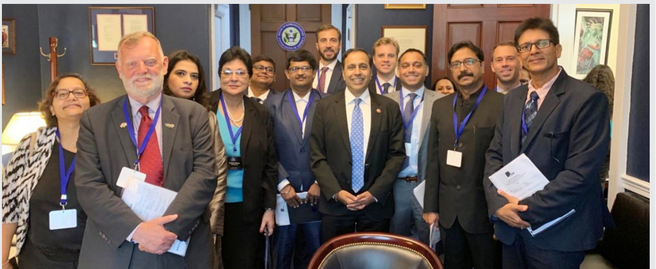
AMCHAM's door knock delegation with Representative Raja Krishnamoorthi (D-IL)