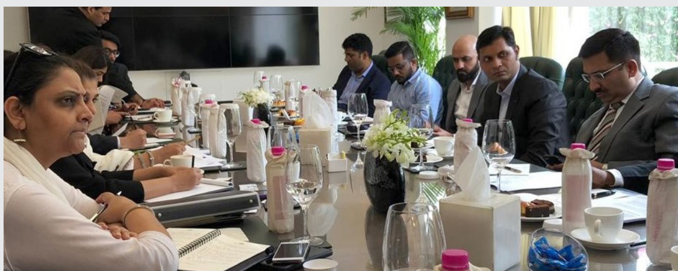
Participants at the USPTO Roundtable on Intellectual Property Concerns in Bangladesh, Sri Lanka and Pakistan

Intellectual property matters have long standing issues in the region so the roundtable discussion brought up thoughts on the IP landscape of Bangladesh, Sri Lanka and Pakistan, along with industry concerns. During the course of the interaction, they also discussed issues relating to IP infrastructure, legislative reforms, IP enforcement and any other related issues and the way forward.