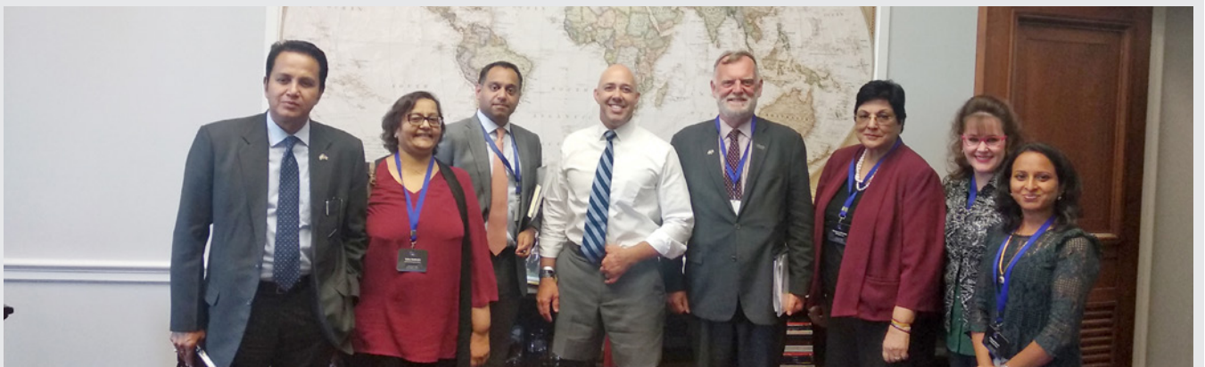
The door knock delegation with Representative Brian Mast (R-FL)