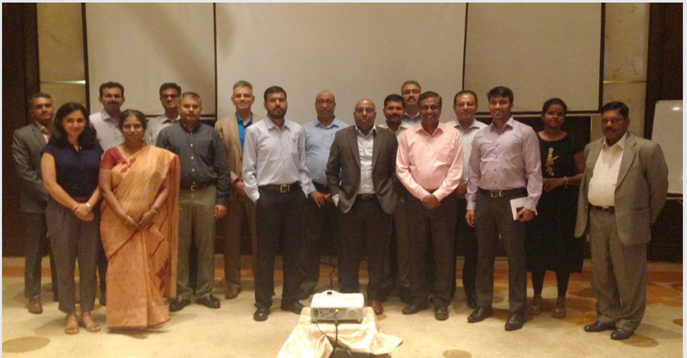
Participants at the meeting on 'Global In-House Centres (GIC) - Emerging Trends and Increasing Relevance'

The meet concluded with an insightful interactive session.