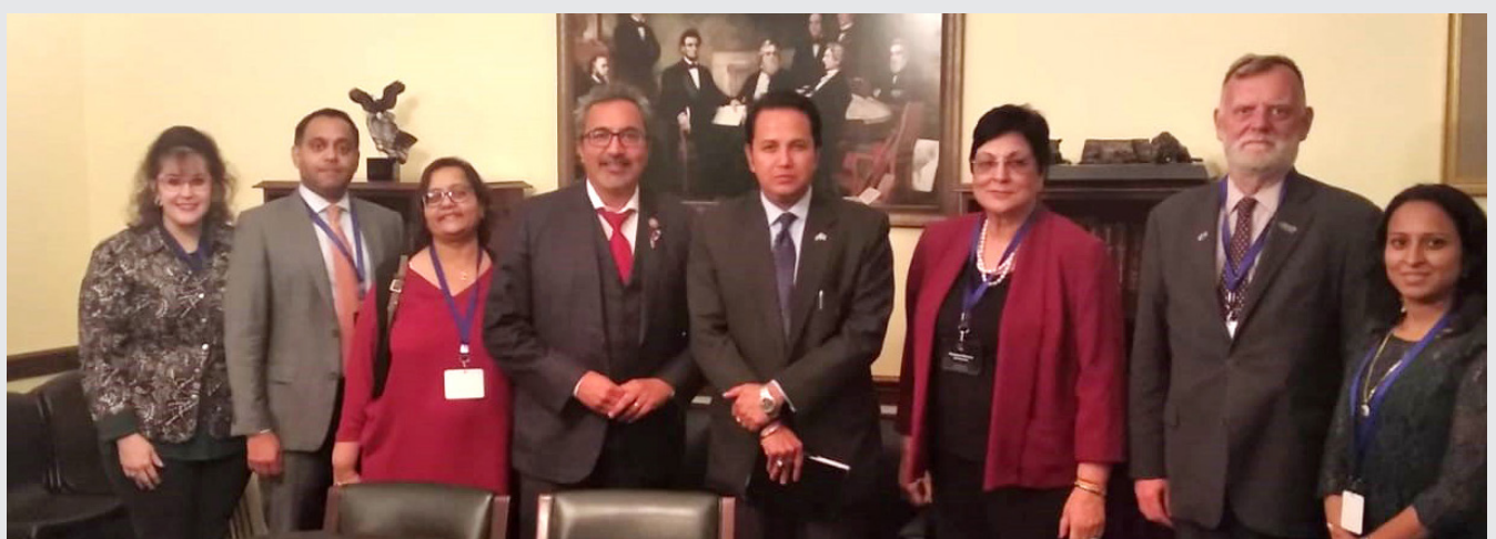
Representative Ami Bera (D-CA) with the door knock delegation in Washington DC