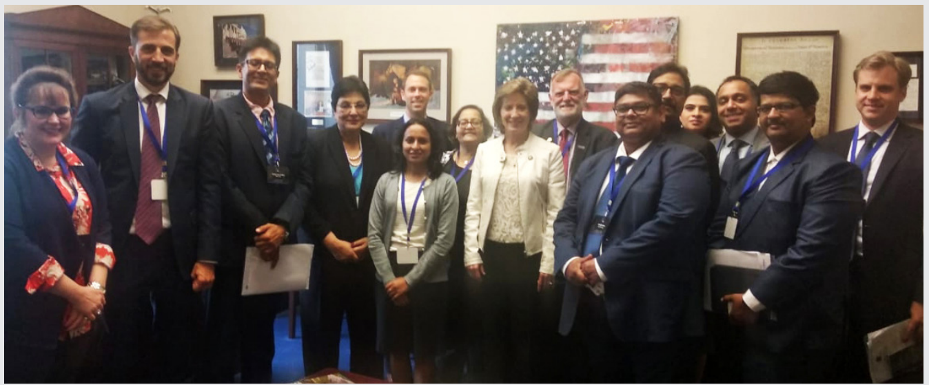
Members of the door knock delegation with Representative Vicky Hartzler (R-MO)