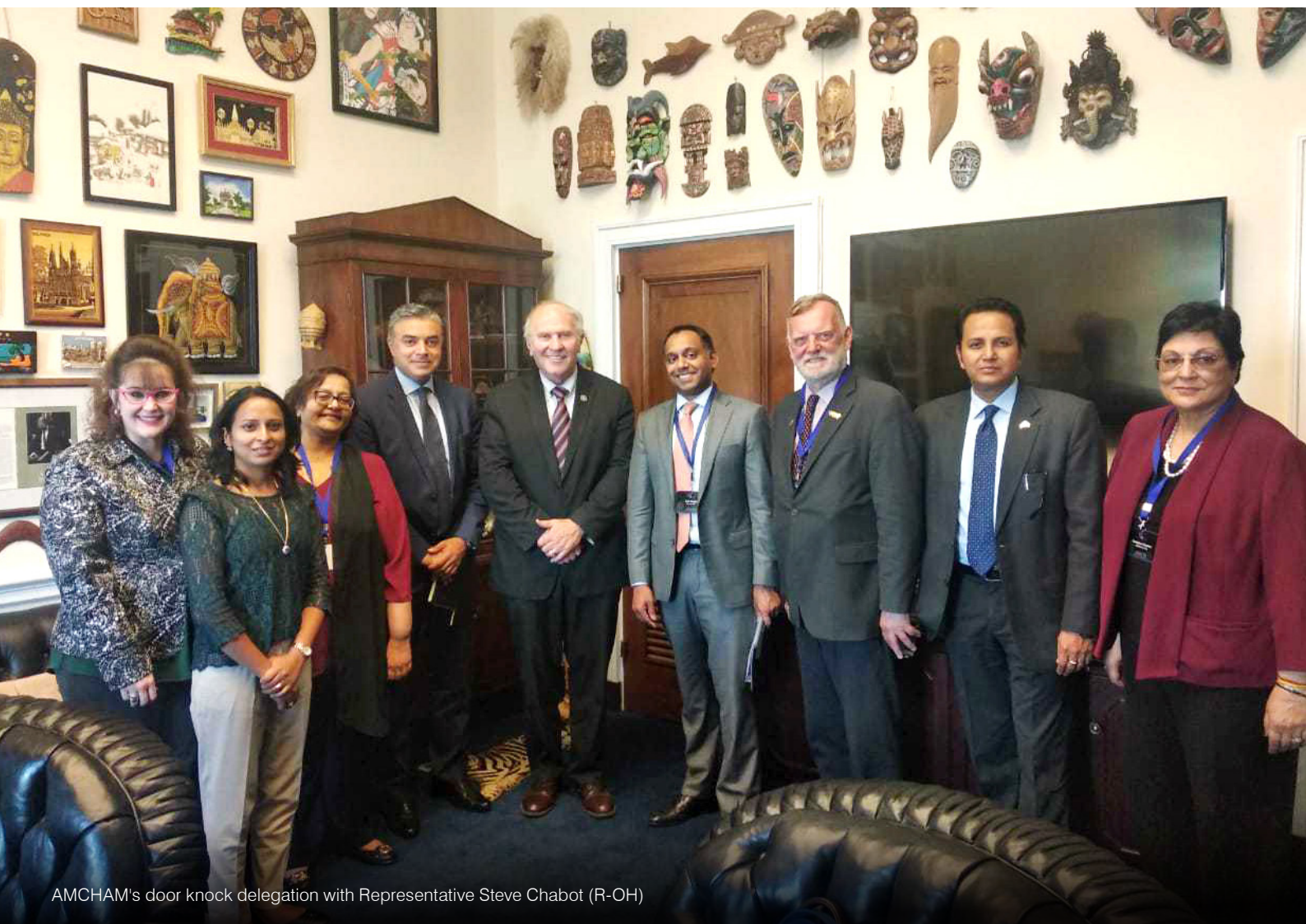
AMCHAM's door knock delegation with Representative Steve Chabot (R-OH)