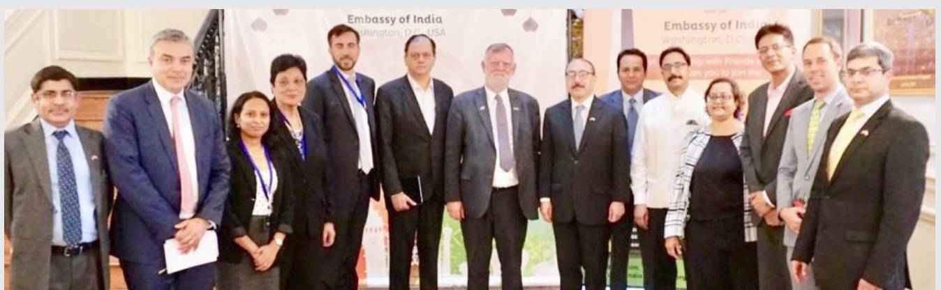
At the Indian Embassy in DC, with Ambassador Harsh Vardhan Shringla, Indian Ambassador to the U.S.