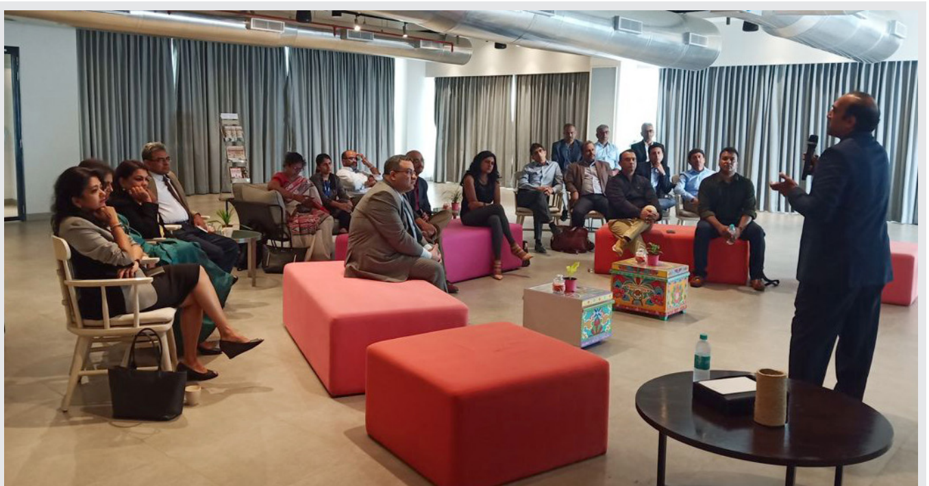
Participants at the 2nd edition of AMCHAM's Karnataka Chapter CEO Breakfast Series