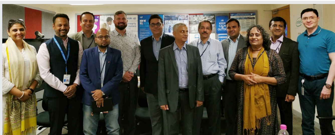
AMCHAM's Cyber Security Committee at their first meeting this year

State wise events across Delhi, Bengaluru and Mumbai would be planned to keep the above thematic areas in mind along with focus group discussion with MeitY and other ministries to deliberate and educate the GOI on global cyber security mandates. The U.S. Embassy has shown interest to support AMCHAM with their initiatives by inviting key government officials and experts from U.S. government to discuss and participate in focused roundtables and events.