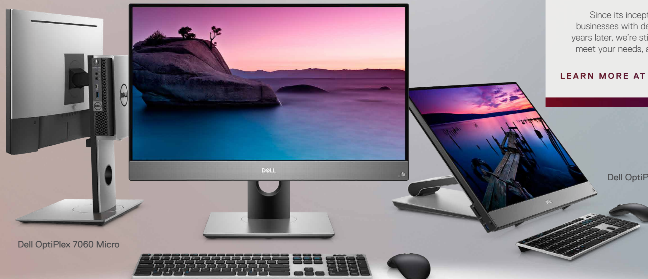
Dell OptiPlex 7060 Micro