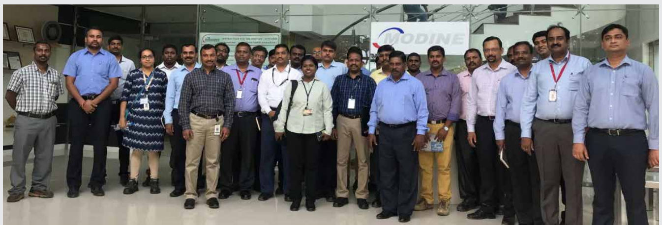
Tamil Nadu Chapter members at Modine