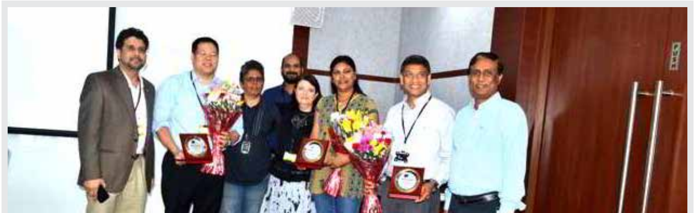
The Hyderabad Chapter farewell for a few Executive Committee members heading back to the U.S.

Hyderabad Chapter, AMCHAM, from Qualcomm, hosted the luncheon farewell.