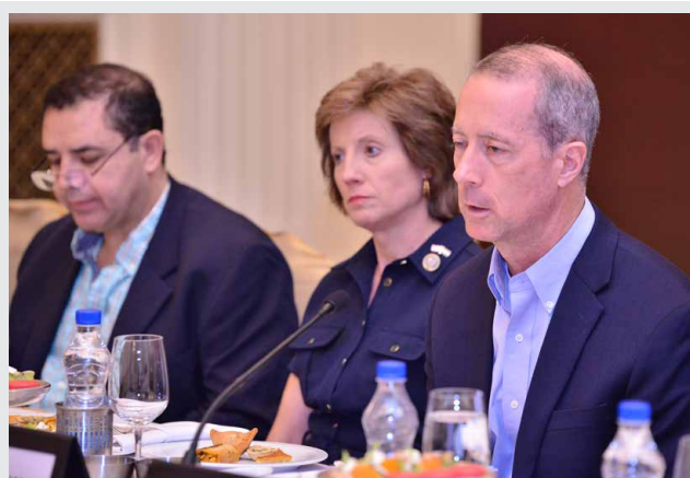
(L-R) Representative Henry Cuellar (D-TX), Representative Vicky Hartzler (R-MO), Chairman Mac Thornberry, (R-TX), Chairman, House Armed Services Committee