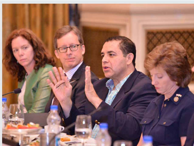
Representative Henry Cuellar (D-TX) expressing his views