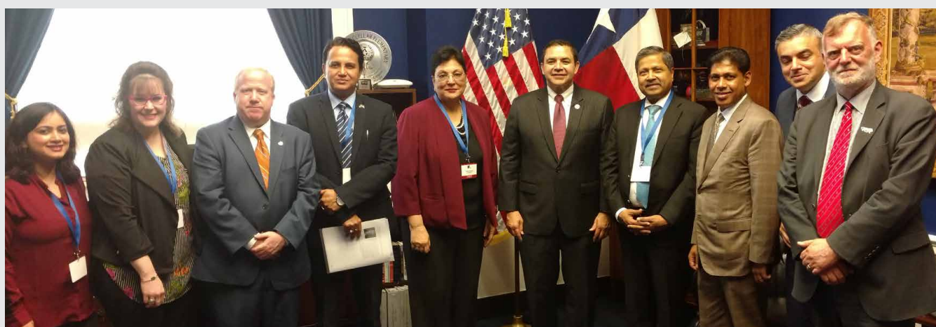
AMCHAM's door knock delegation with Representative Henry Cuellar (R-TX)