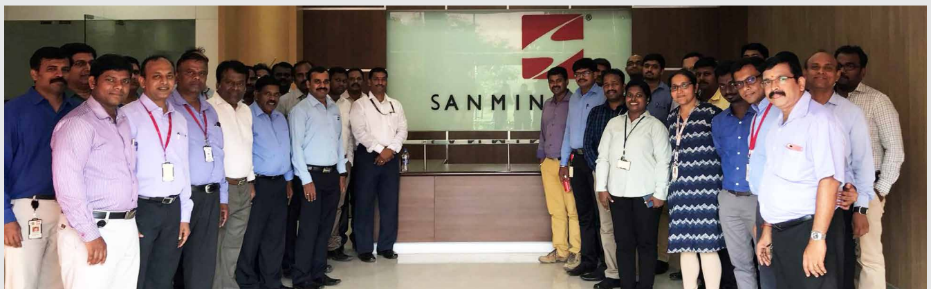
Tamil Nadu Chapter members at Sanmina

For participants, the primary objective of plant tours is to learn. The first way to enhance learning is to focus on practices. AMCHAM's plant tours provide an opportunity to observe how work actually gets done. The visit had 38 participants whose work roles ranged from manufacturing, facilities management, business development, strategy and consulting. Of the four plants visited Dell and Sanmina are electronic hardware manufacturing companies, while Modine and BorgWarner are automotive component manufacturers.