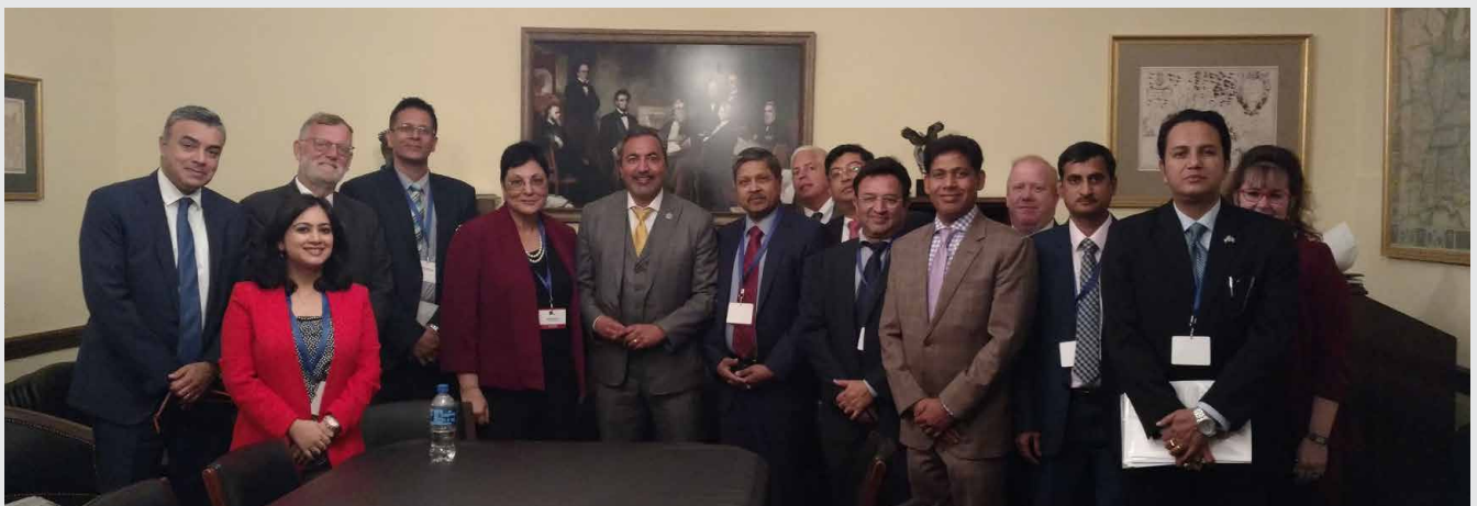
AMCHAM's door knock delegation with Representative Ami Bera (D-CA)