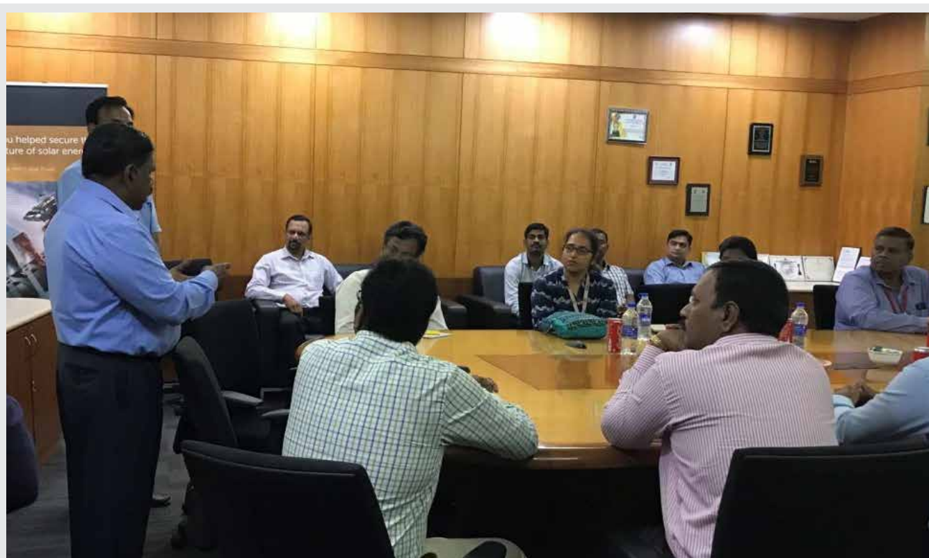
Members at the Dell manufacturing facility