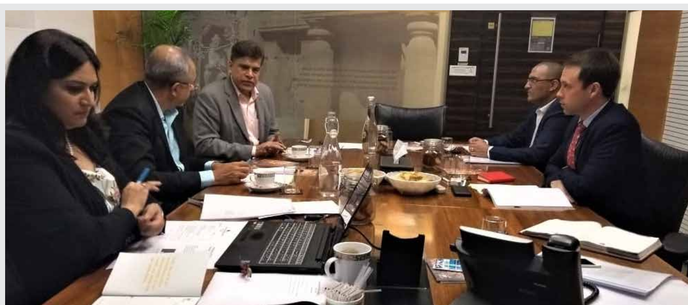
Western Region Committee meeting in progress

showcase of AMCHAM India and its principles, WR member profiles, footprint, events, communication platforms, activities and publications were presented. A flash back of events in 2017 – 2018 reiterated the accomplishment of the business plan for the past year. The discussions further focused on the road map for 2018 – 2019, membership outreach and expansion, state government engagement, WR business plan and budget, and other items on the agenda. The meeting concluded with an encouraging vision for the year!