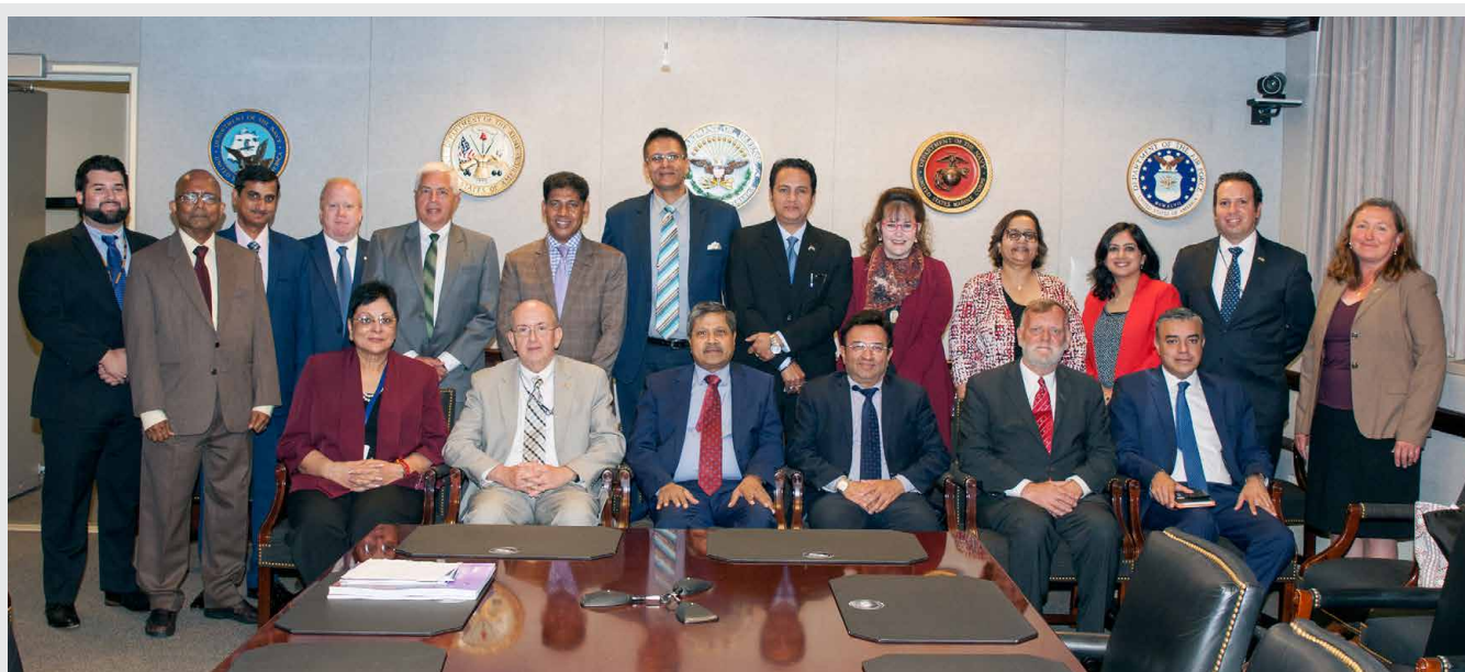
AMCHAM's door knock delegation at the Pentagon with officials from the India Rapid Reaction Cell, U.S. Department of Defense