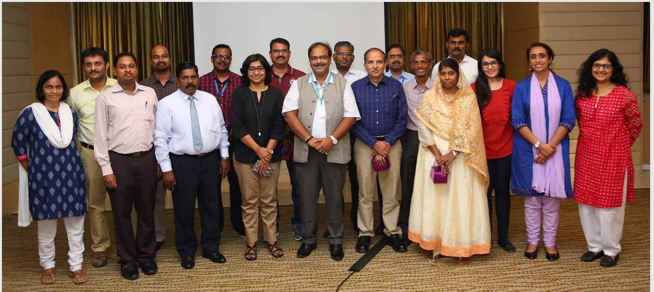
CSR Managers at the meeting with UNICEF on capacity building