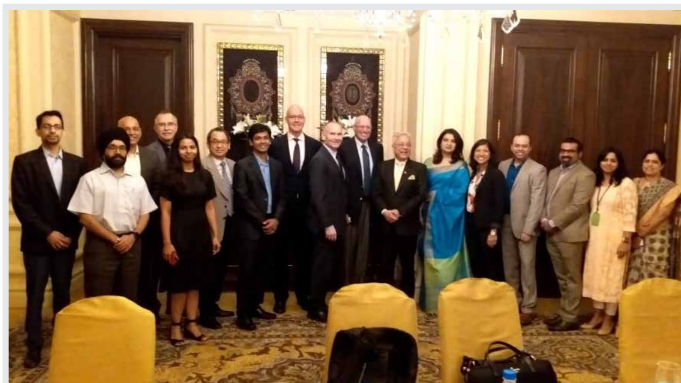
Participants at AMCHAM's Pharmaceuticals Committee meeting with the Alliance for Safe Online Pharmacies delegation