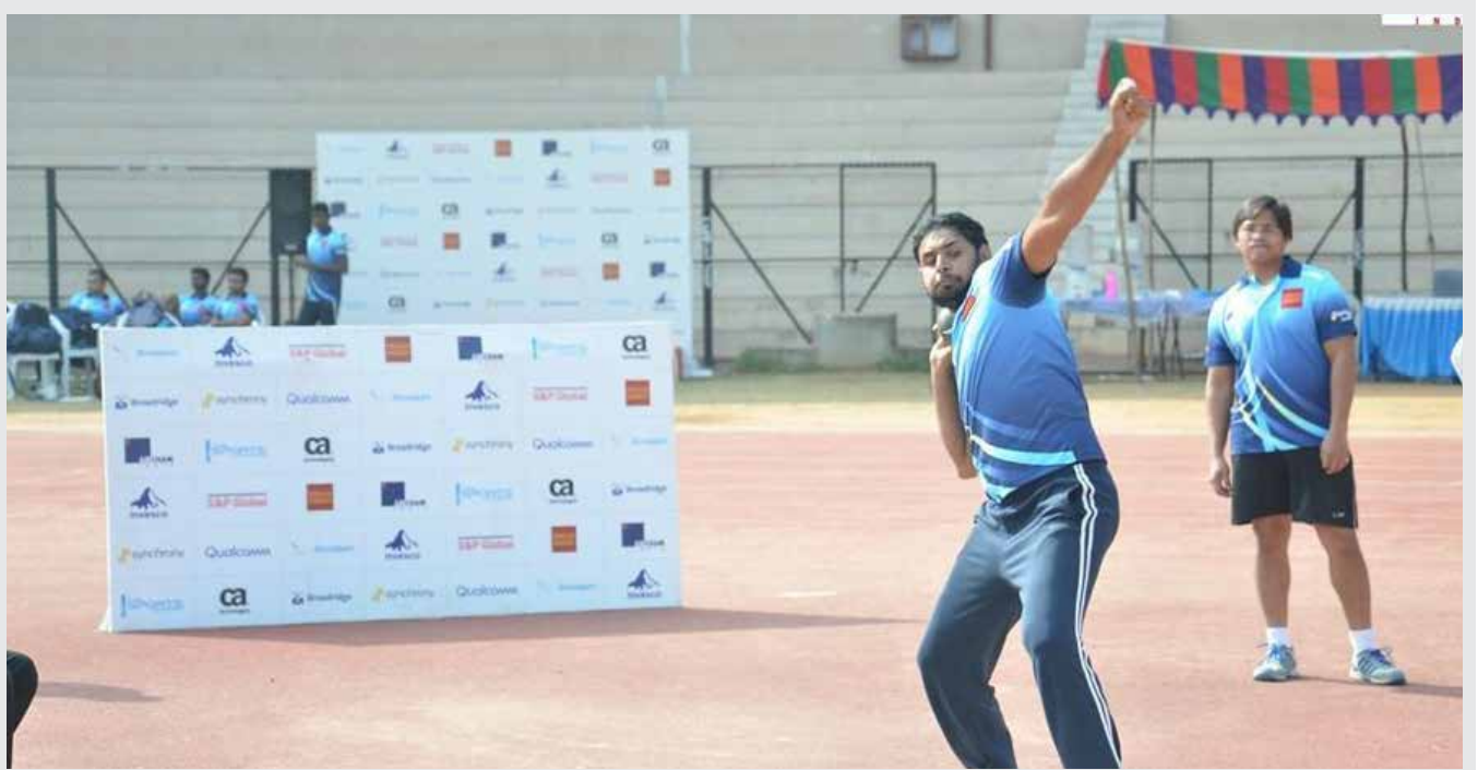
Short Put game in progress