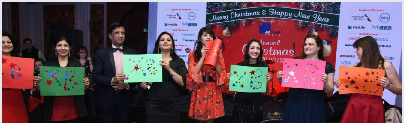
Members enjoying games