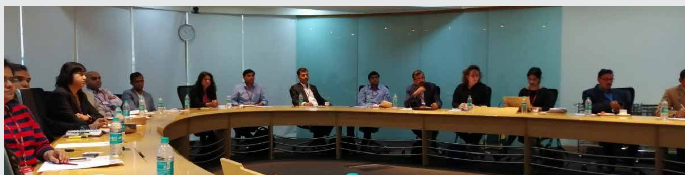
The HR Committee meeting in progress