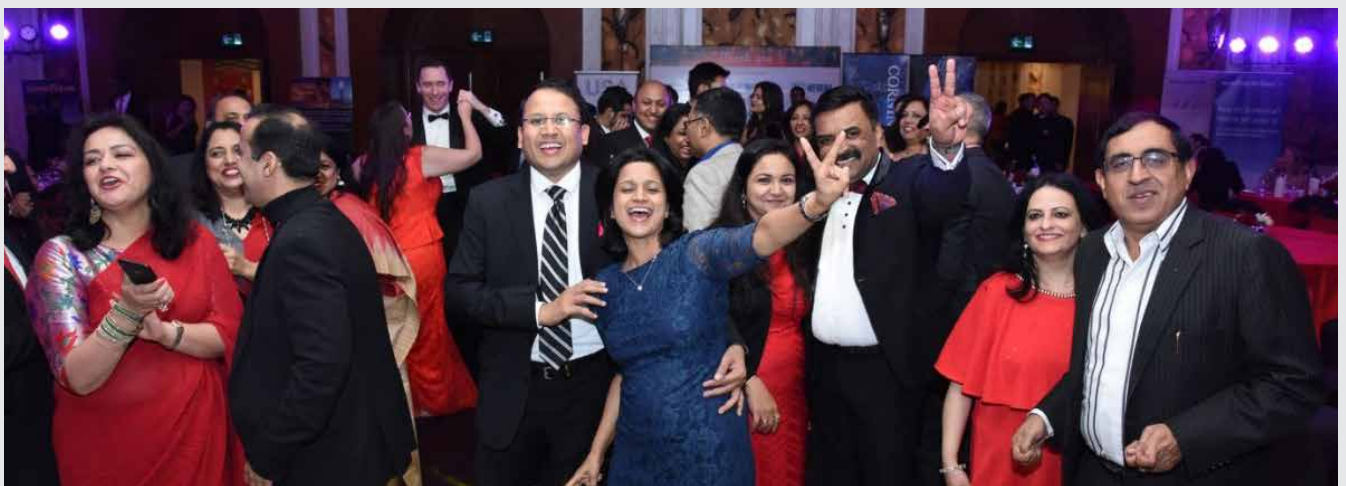
AMCHAM members enjoying the entertainment