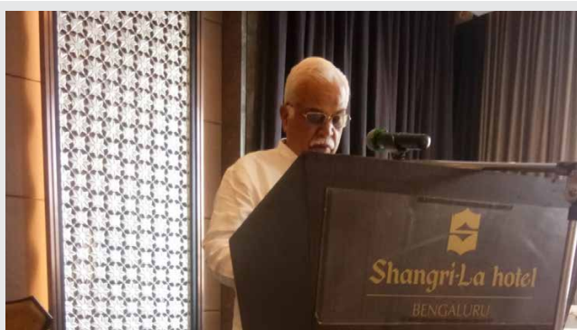
Mr. R V Deshpande, Minister of Revenue and Skill Development for Karnataka State addressing participants