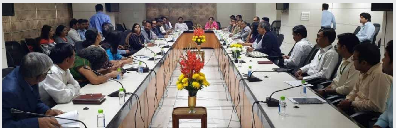
Representatives from the Ministry of Electronics and Information Technology and its nodal departments and representatives from Department of Telecom at a roundtable