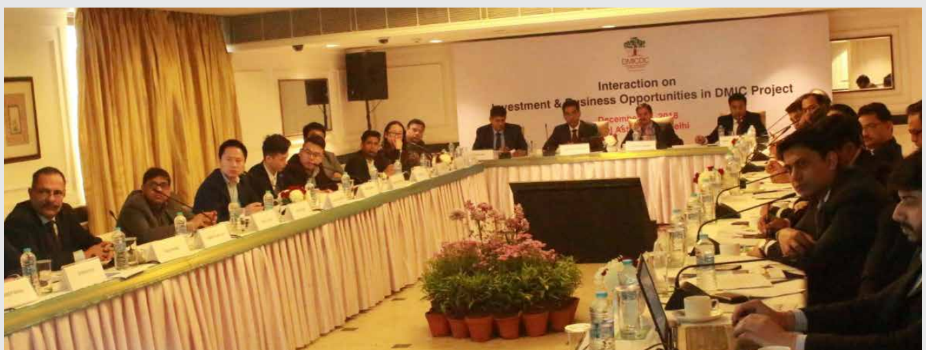
AMCHAM members at an Investment Promotion Workshop by DMICDC

opportunities that exist for investing in India's rapid infrastructural development through various flagship programs most of which are in advanced stages of development. After the presentations, a one-on-one session was organized for interaction with the CEOs of projects. Representatives of the four AMCHAM member companies had an opportunity to closely interact with the three CEOs, discuss their issues and make suggestions. The discussions have resulted in DMICDC looking forward to meeting with members on any specific issues that come up. The event closed with all participants looking forward to materializing collaboration and with an offer by DMIC to host a similar workshop exclusively for U.S. companies.