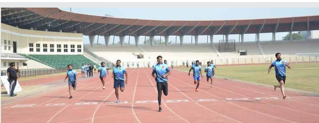
Men's 100 meters race

This year saw an increase in participation in football, men's volleyball and throwball. 261 players were declared winners and runners in the 12 categories that were held namely – cricket, basketball, throwball, football, men's volleyball, women's volleyball, tennis, badminton, table tennis, carom, chess and athletics. This year Wells Fargo were the cricket champions ousting the previous year's champions, Qualcomm, in the finals.