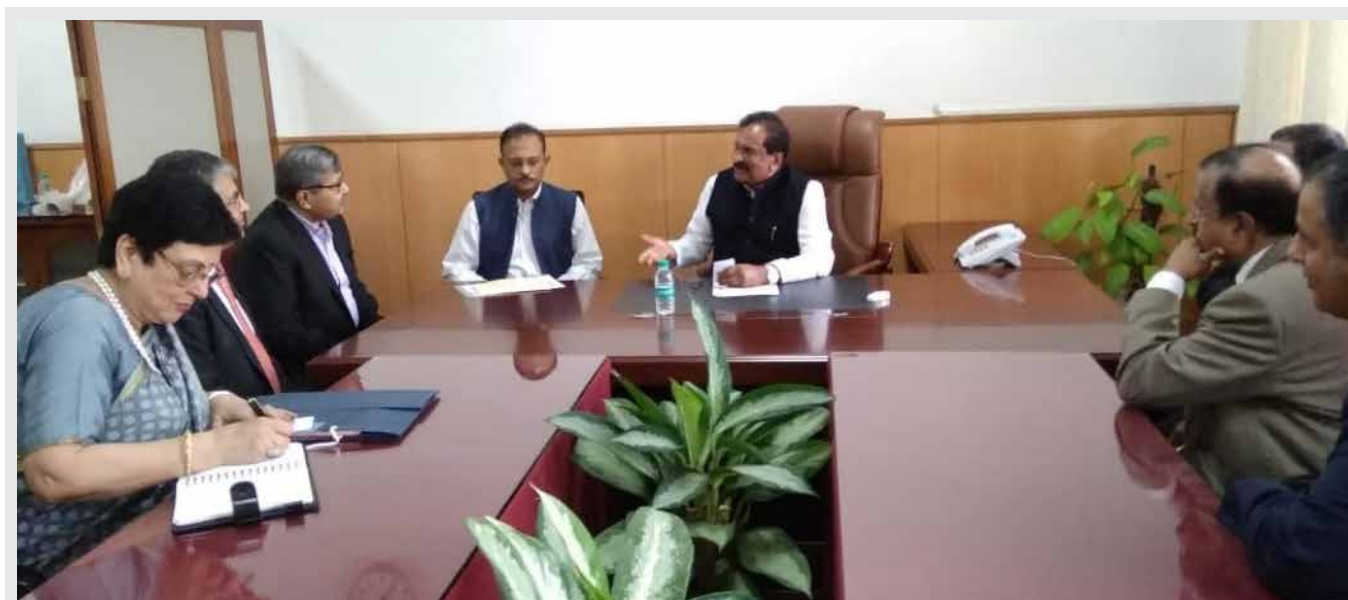
NEB members in a meeting with Mr. K. J. George, Minister of State for Industries and Minister of State for IT & BT, Government of Karnataka in Bengaluru