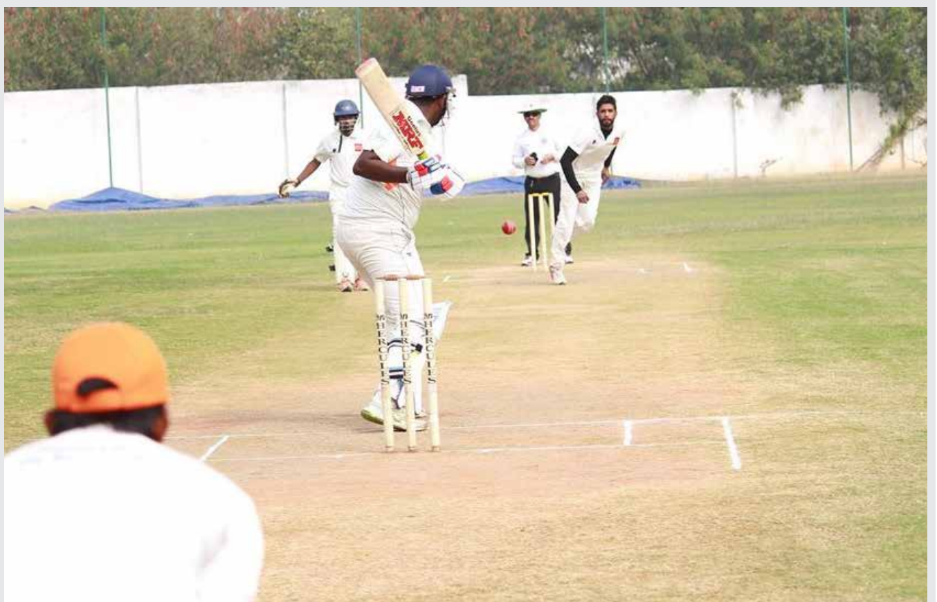
Cricket Finals – Qualcomm vs Wells Fargo at Vijay Anand Cricket Grounds, Shivrampally