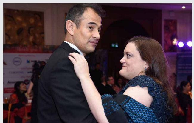
The first couple on the dance floor