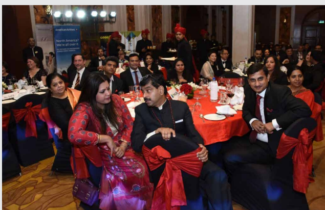
Guests at the Christmas Ball