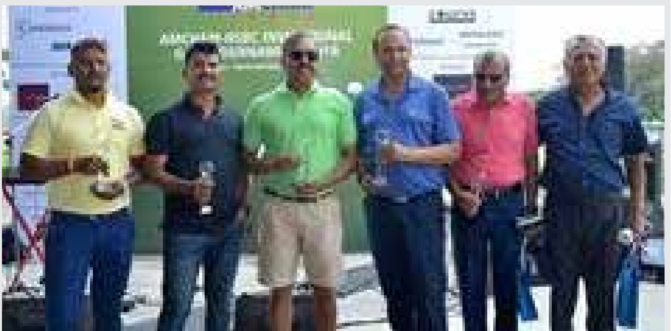
Golf tournament prize winners