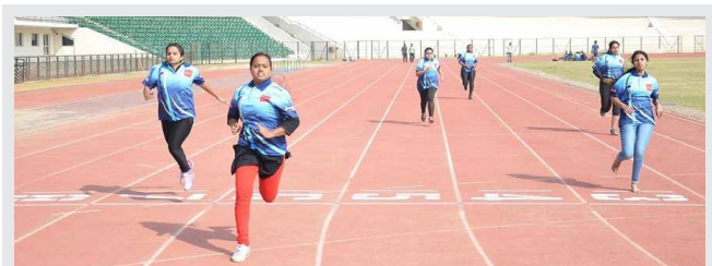
Women's 100 meters race