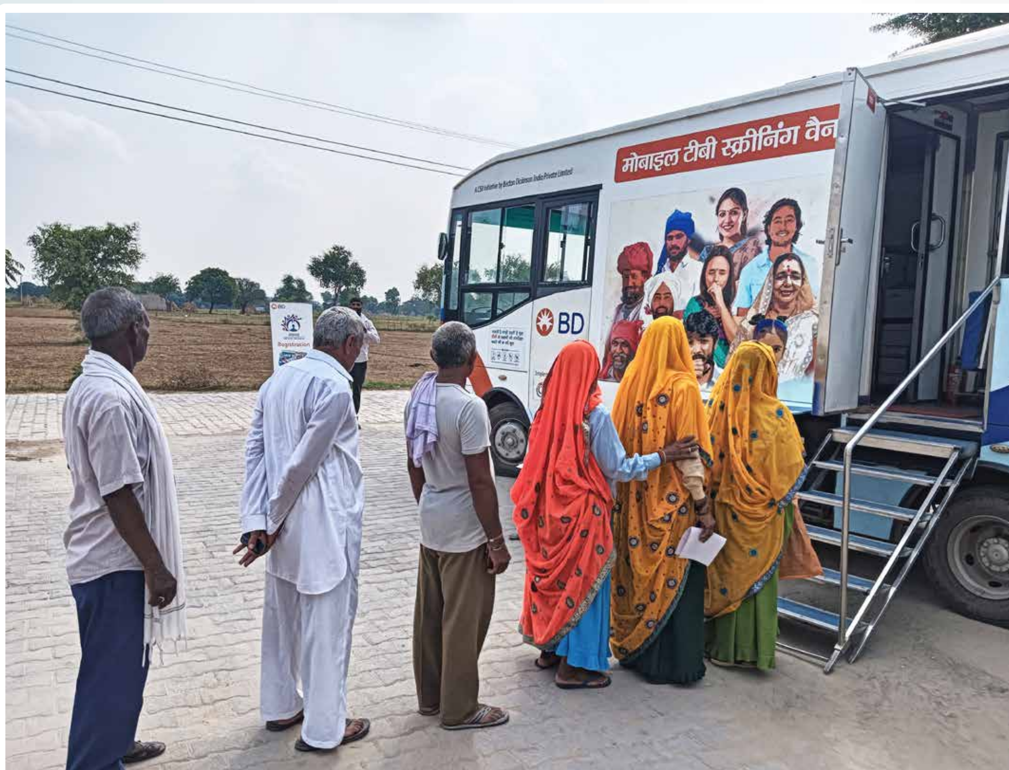
Presumptive TB cases getting screened at the SANKALP mobile van, in Rewari (Haryana) — a CSR initiative by Becton Dickinson India Pvt. Ltd.