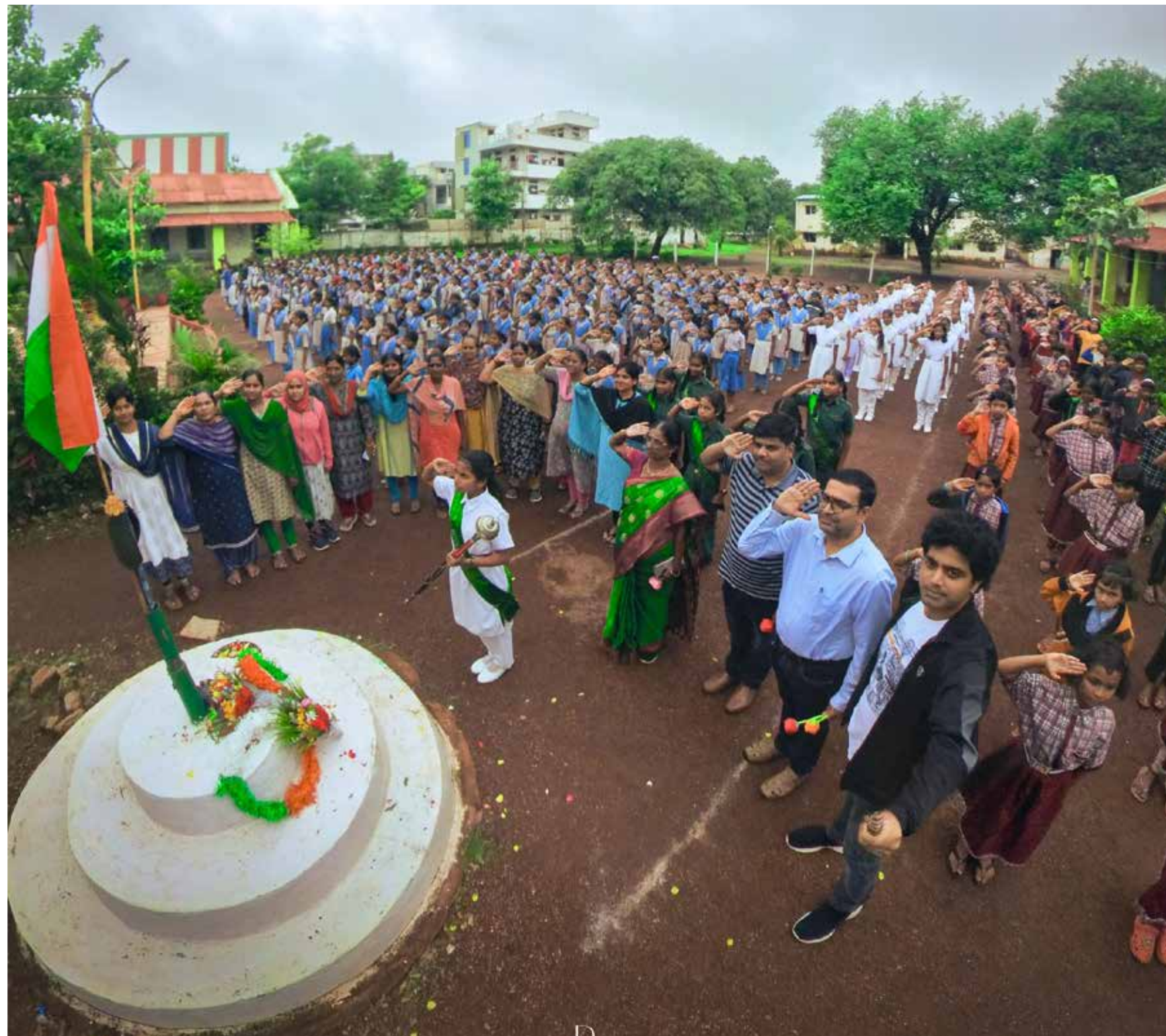
Honouring the courageous warriors who gave their lives to end the Kargil War at T.S.R.J.C. Girls High School, Telangana with Baker Hughes volunteers