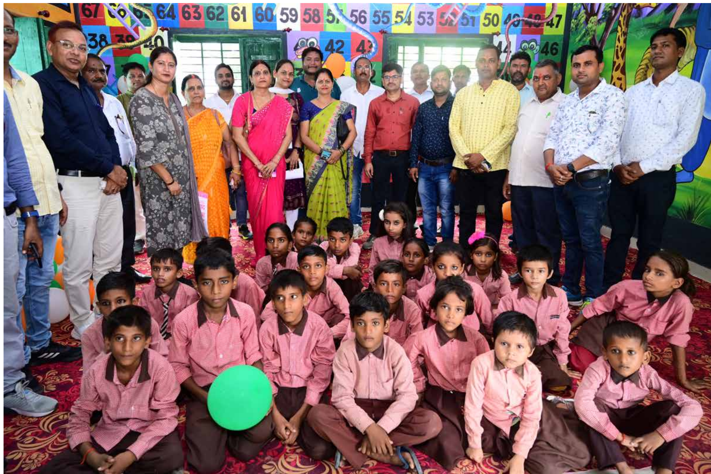
Smart class in Ayodhya, Uttar Pradesh sponsored by Congruent Info-Tech