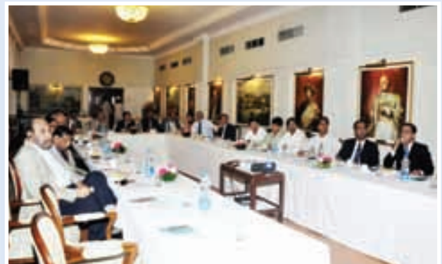
Participant at the summing up session of the AMCHAM budget interactive session.