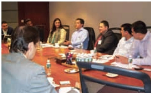
AMCHAM workshop on “Currency Risk Management”