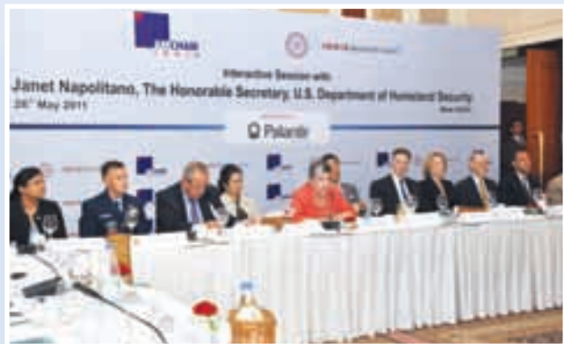
AMCHAM India along with USBIC organized an interactive session with Ms Janet Napolitano, Secretary, U.S. Department of Homeland Security.