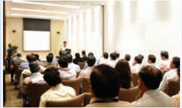
Session on “Special Economic Zone” organized by AMCHAM along with NASSCOM.