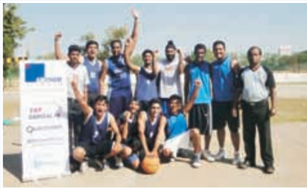
Deloitte - Winners of Basketball.