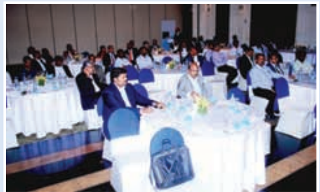
Participants at a meeting with the U.S. Exim Bank Chairman at ITC Kakatiya.