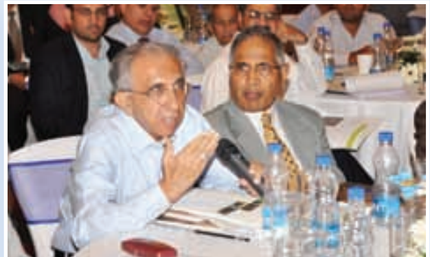
AMCHAM participants at the "Enterprise Risk Management" workshop.