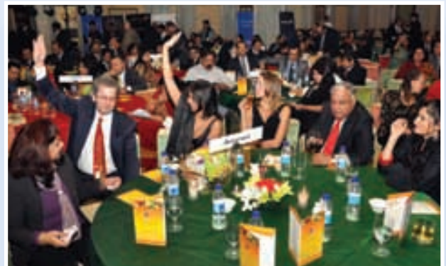
AMCHAM Members in festive mood at AMCHAM Annual Christmas Ball.