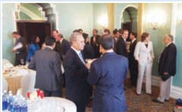
AMCHAM Mumbai members networking prior to the event.