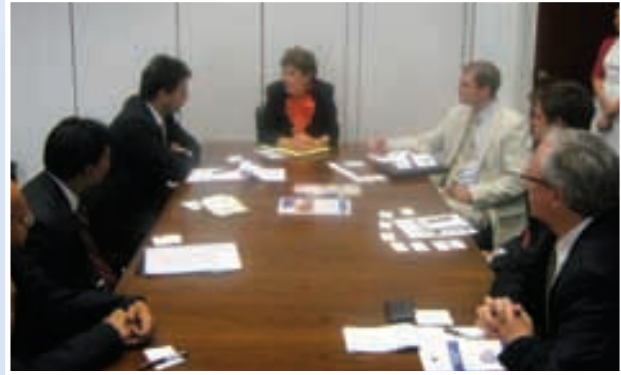
Doorknock meeting in progress.