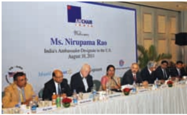
An interactive meeting with Ms Nirupama Rao, India's Ambassador-Designate to the U.S.