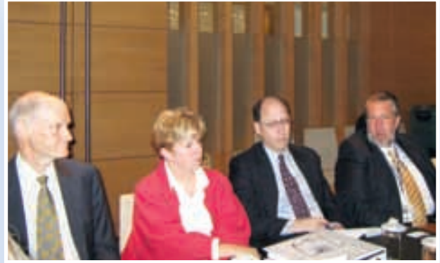
A roundtable discussion with Ms. Jane Holl Lute, Deputy Secretary, U.S. Department of Homeland Security.