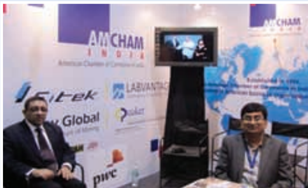
AMCHAM member companies during "Bengal Leads" Summit.