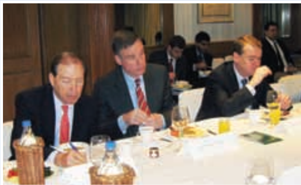
AMCHAM roundtable discussion with Senator Tom Udall and Senator Mark Warner.