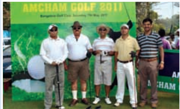
AMCHAM Invitational Golf Tournament.