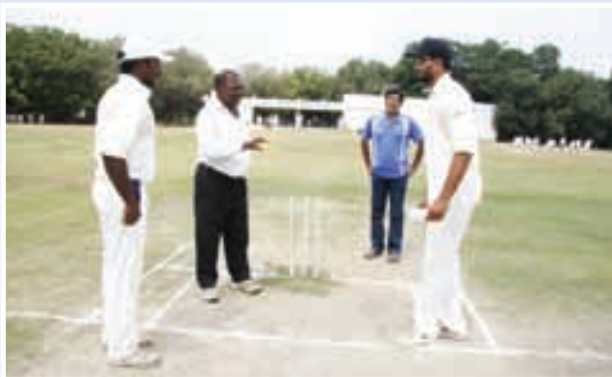
Shotput Women winners - Capital IQ emerged winner with Invesco in runner up place.