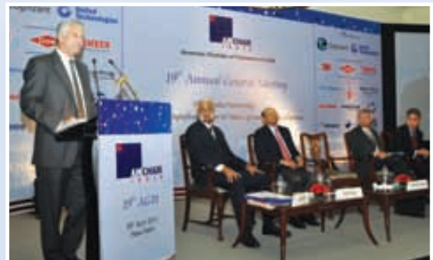
Special Session with U.S. Ambassador, H.E. Mr. Timothy J. Roemer during 19th Annual General Meeting.