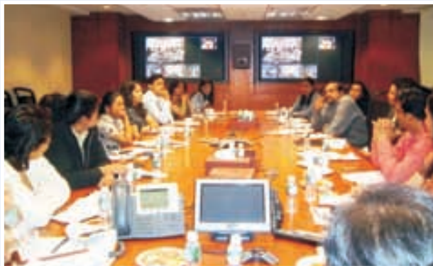
Panel Discussion on “Building Talent Pipelines” - Discussion in progress.