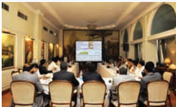
Members' meet and Budget Interactive Session was hosted by AMCHAM Eastern India at the Bengal Club.