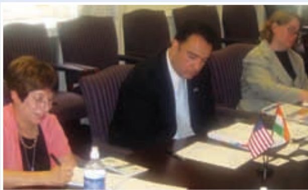
Doorknock meeting in progress.