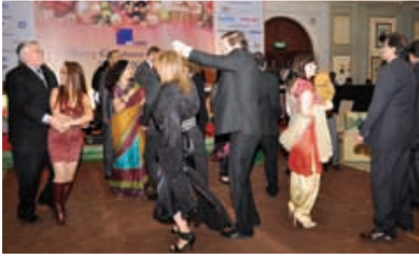
AMCHAM Members dancing all the way during Annual Christmas Ball.