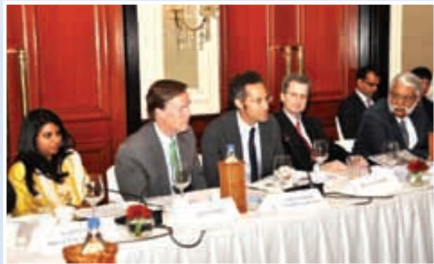
A Round Table discussion with Ambassador R. Nicholas Burns and Dr. Alex Karp of Palantir Technologies, Inc.