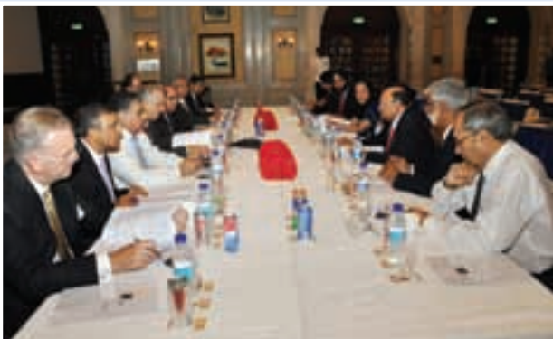
AMCHAM National Executive Board Meeting in progress.