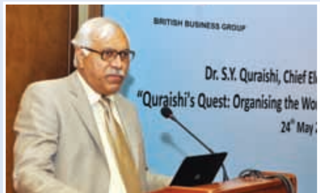
Dr. S.Y. Quraishi, Chief Election Commissioner of India addressing AMCHAM members on "Quraishi's Quest: Organizing the World's Most Complicated Elections".