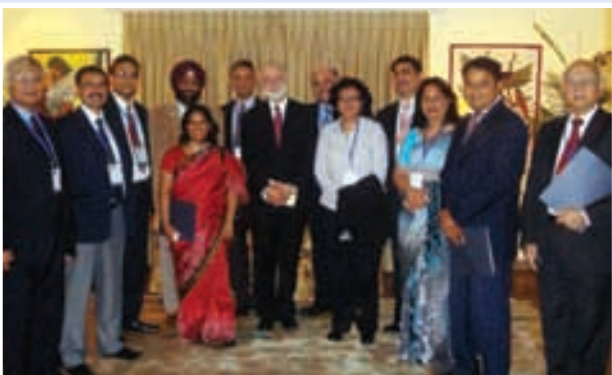
A group photograph of members of AMCHAM India Delegation to Nepal.