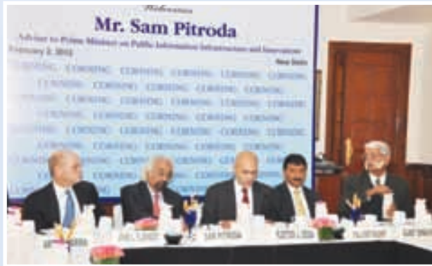
Round Table with Mr. Sam Pitroda, Adviser to Prime Minister on Public Information Infrastructure and Innovations.