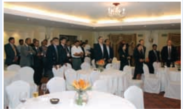
CEOs and heads of U.S. companies at the IT Secretary's meeting.