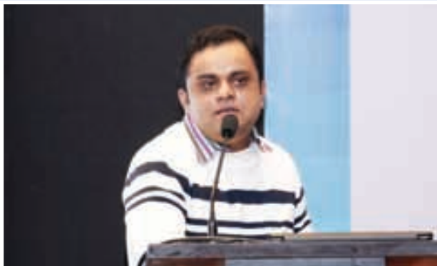
Mr. Bratya Basu, Minister for Higher Education, Government of West Bengal.