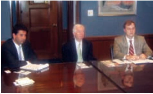
Doorknock meeting in progress.