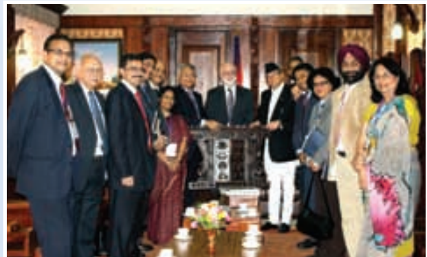
Members of AMCHAM India delegation to Nepal with former Prime Minister of Nepal, Mr. Jhala Nath Khanal.