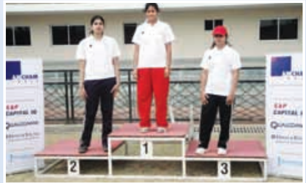
Qualcomm VS Franklin Templeton Toss and instruction by HCA Umpire.