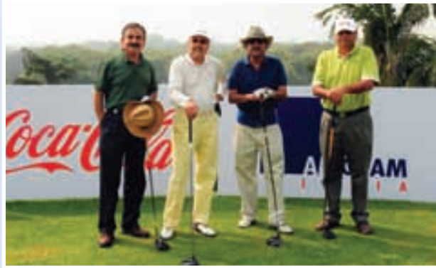
Getting ready for a game - 4th AMCHAM India Amateur Invitational Golf Tournament.